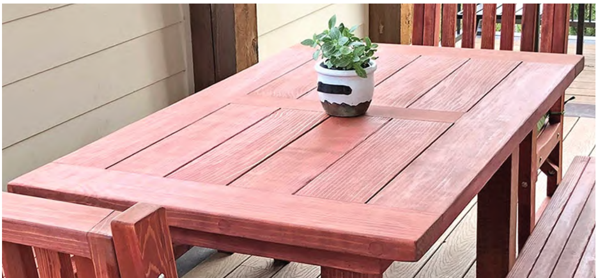
Old Country - Standard Tabletop Design

Both Standard and Seamless Tabletops can be further customized in Old Country Tabletop Style, an old European design that features a perimeter frame with a horizontal dividing board across the center.