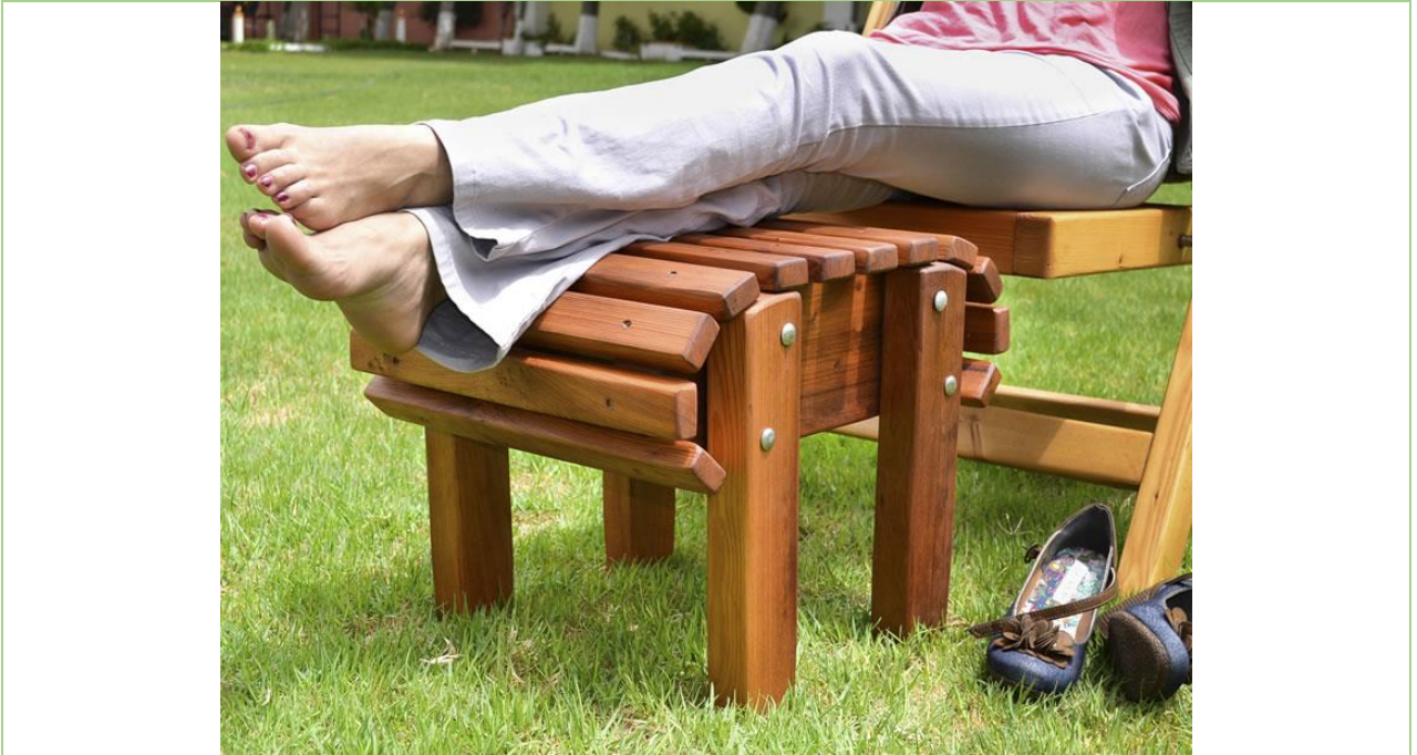
L-R: Flat Ottoman

Kick back and relax with either our Standard Ottoman or Flat Ottoman. The Flat Ottoman can also be used as a side table! We can build it in any size you need, just contact us .