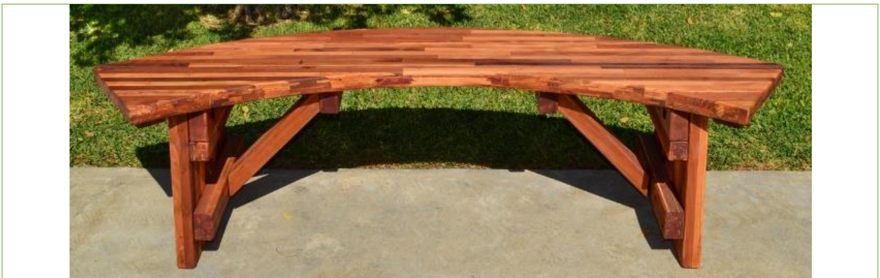
Arc Picnic Bench