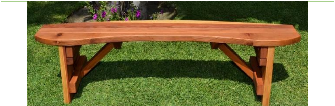
Round Picnic Bench (Default)