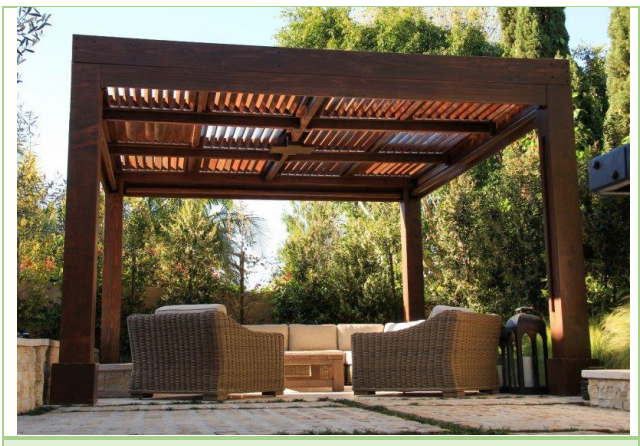
Here is how the Coffee Stain looks like on Redwood