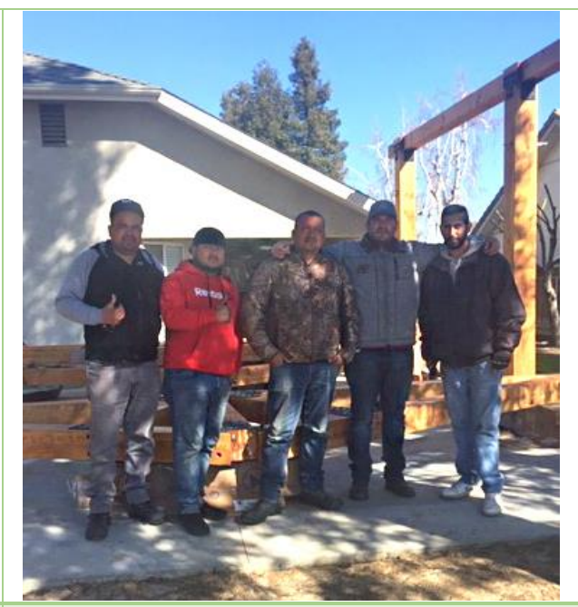
Some of the ugly guys from our install crew that will scare your children when they come install your order!