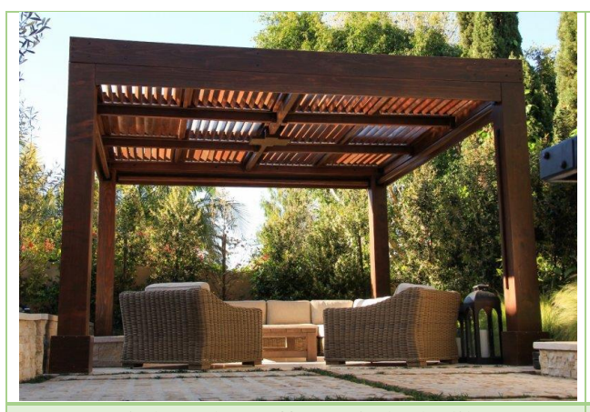
Here is how the Coffee Stain looks like on Redwood