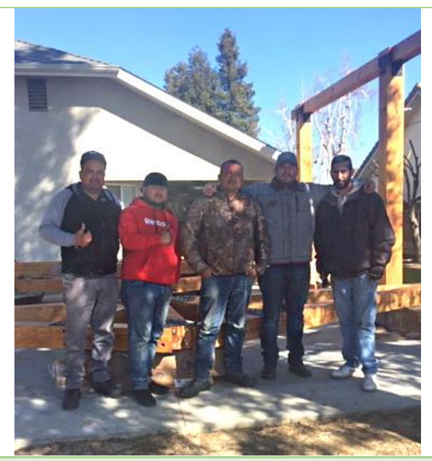
Some of the ugly guys from our install crew that will scare your children when they come install your order!