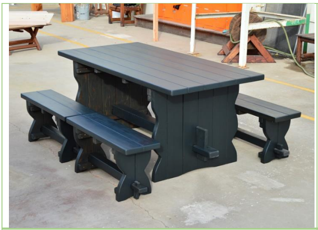
Here is how the Black Premium Stain looks like on Redwood