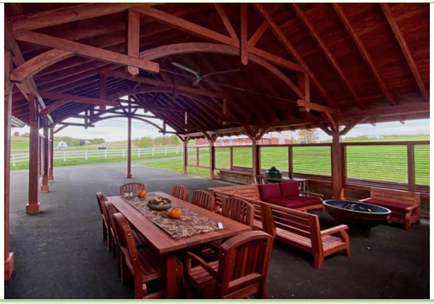
Here is how the Cherry Stain looks like on Redwood