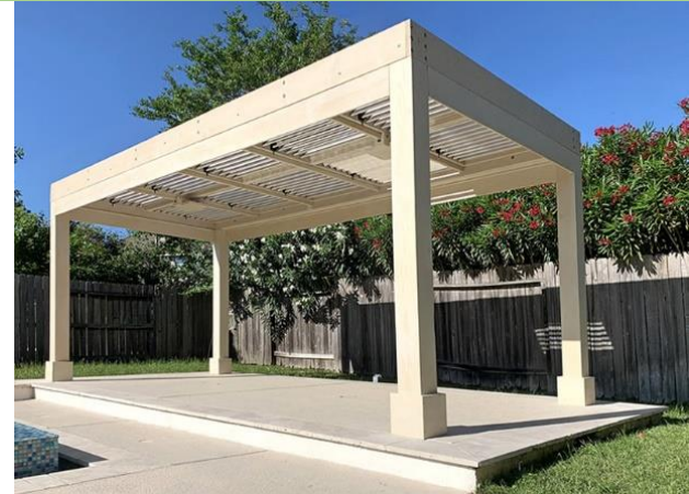
Here is how the White Wash looks like on Redwood