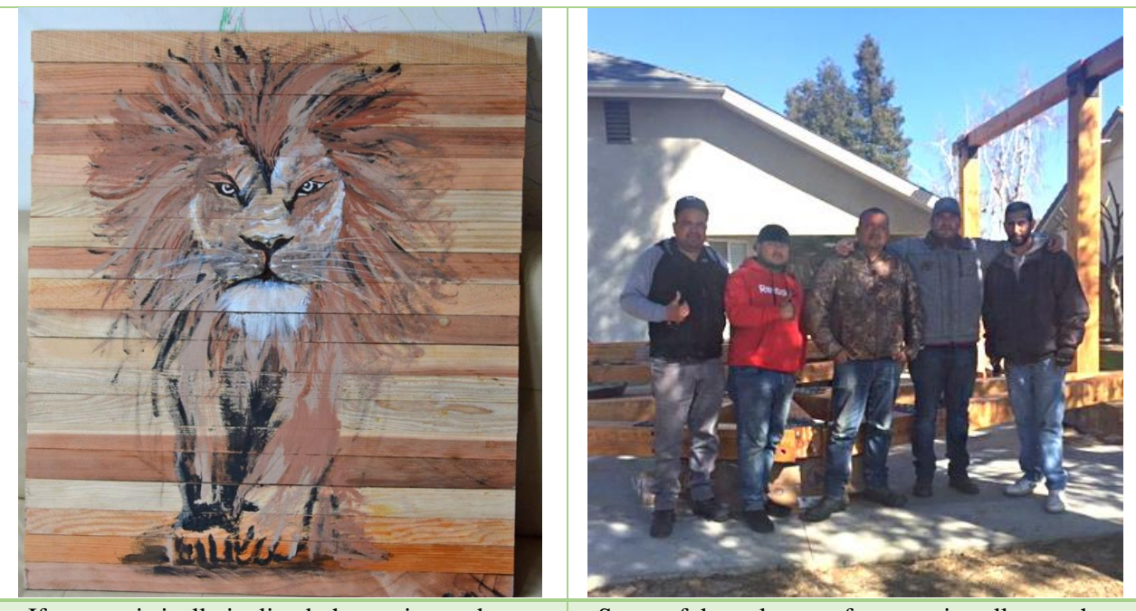
If your artistically inclined, the crating makes a great canvas to: Lion of the Tribe of Juda by Patricia Vallejo

Assembly Service Available Nationwide: All orders over $3,000. in size can choose to have Forever Redwood assemble for you. Just choose White Glove Service in the Shopping Cart or at Checkout. For more information on White Glove, please go to: <u>WHITE GLOVE</u>.