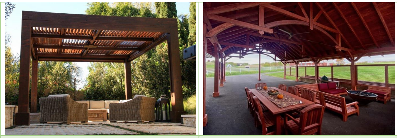
Here is how the Coffee Stain looks like on Redwood