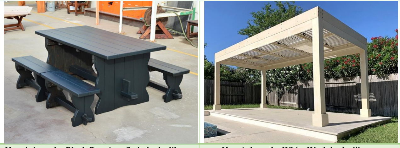
Here is how the Black Premium Stain looks like on Redwood