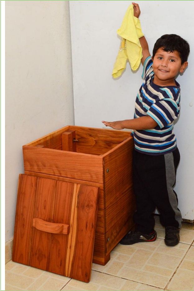
Unattached to Hamper