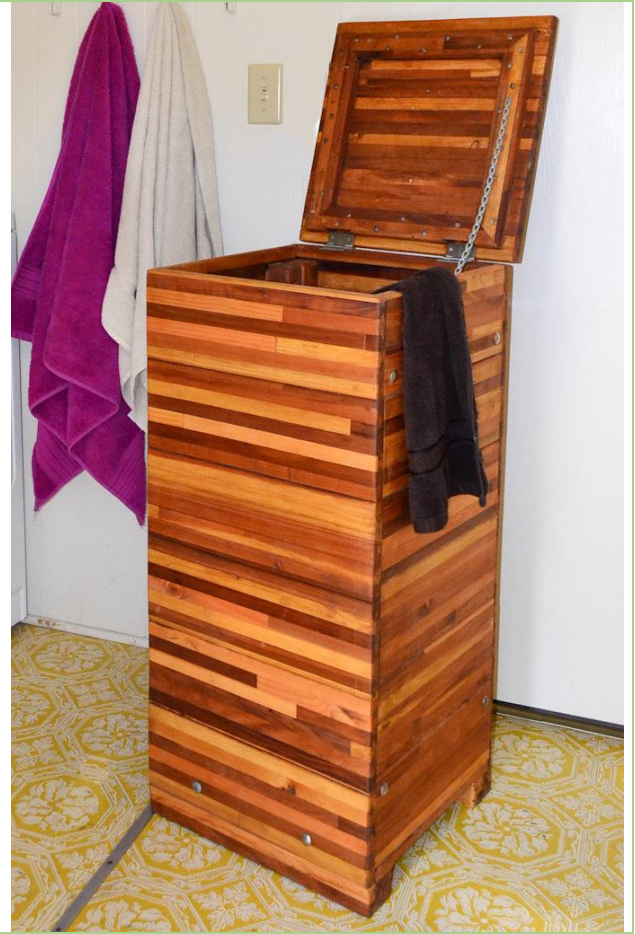
Attached with stainless steel hinges and piston system.