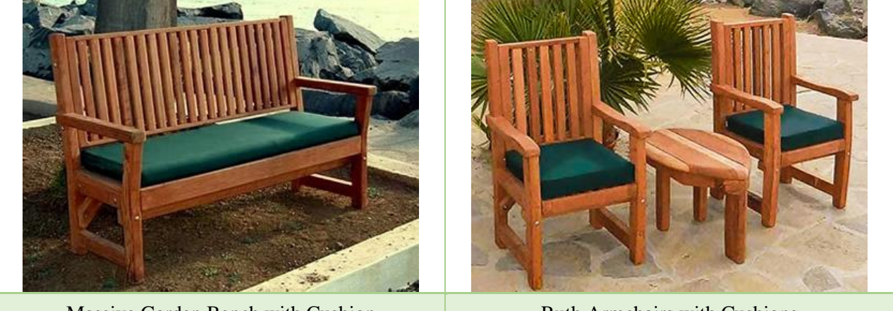
Massive Garden Bench with Cushion