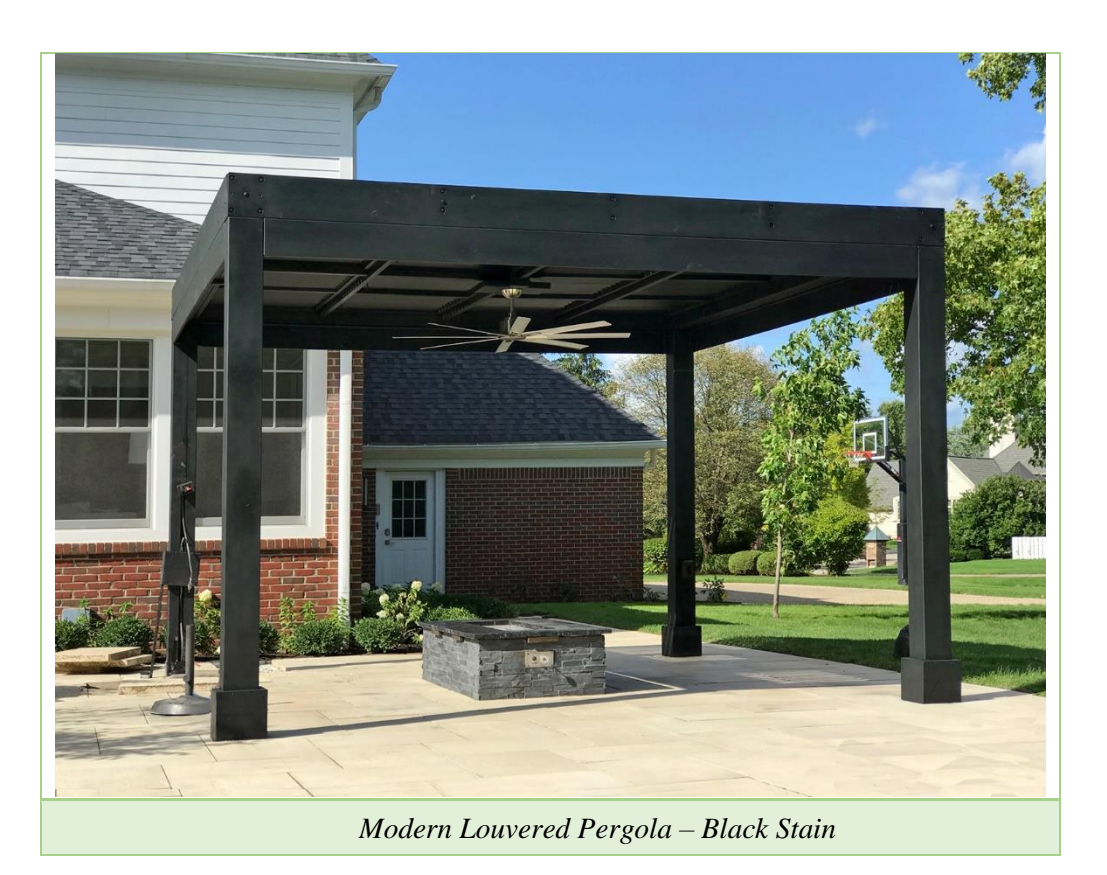
Benjamin Moore: Black Stain, 2131-10

First select the type of paint you want: Benjaminmoore.com