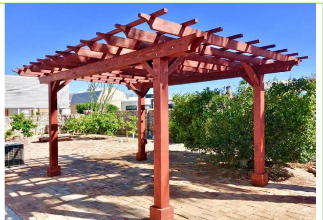
Here is how the Cherry Stain looks like on Redwood