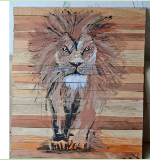
If your artistically inclined, the crating makes a great canvas to:

Assembly Service Available Nationwide: All orders over $3,000. in size can choose to have Forever Redwood assemble for you. Just choose White Glove Service in the Shopping Cart or at Checkout. For more information on White Glove, please go to: <u>WHITE GLOVE COMPLETE ASSEMBLY SERVICE</u>