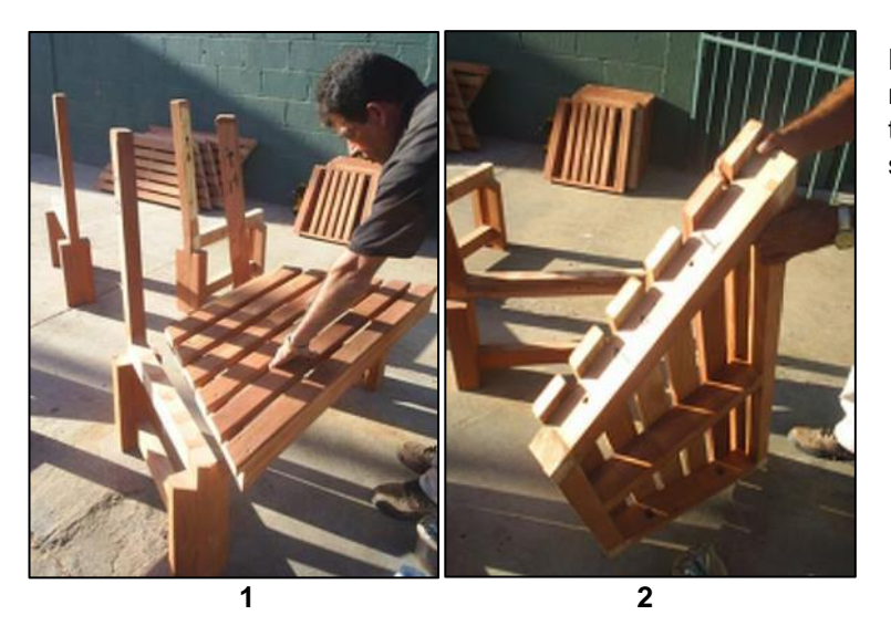
Photo 1 and 2 : Take the seat marked as number 1 and place it between the 2 legs, then attach the parts with 2 bolts on each side as shown in photos.

Your Tree Bench was fully assembled before being broken down for shipping. All the parts fit. Gently tap the bolts all the way into the wood (to set in place) then add a washer and lightly tighten. Do not over tighten or you'll crush the wood and weaken the structural strength of your set. If you are forcing a bolt into place, you either have the wrong part or it is not aligned or it is turned around.