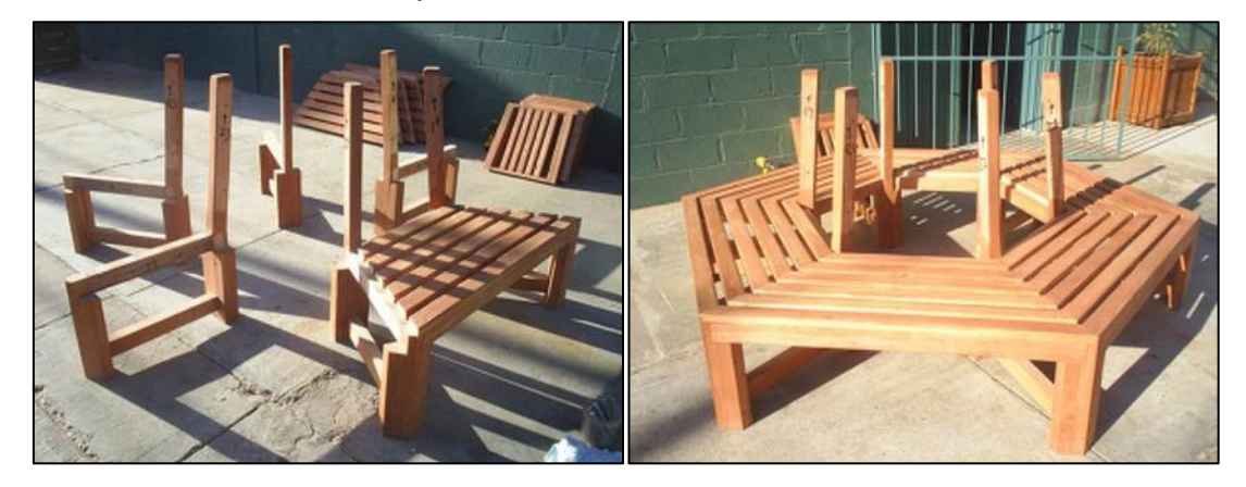
Photo 3, 4 and 5: Attach the backrests with 2 bolts each, on each side, as shown in photos 3, 4 and 5.

Once finished the seats will look this way.