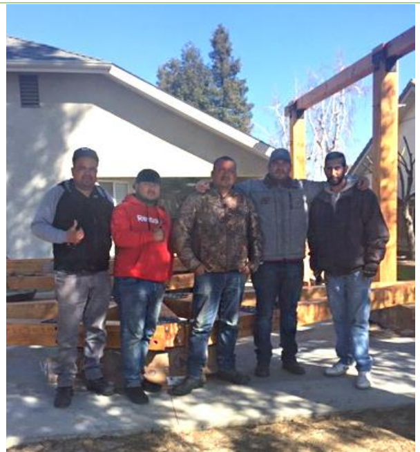
Some of the ugly guys from our install crew that will scare your children when they come install your order!