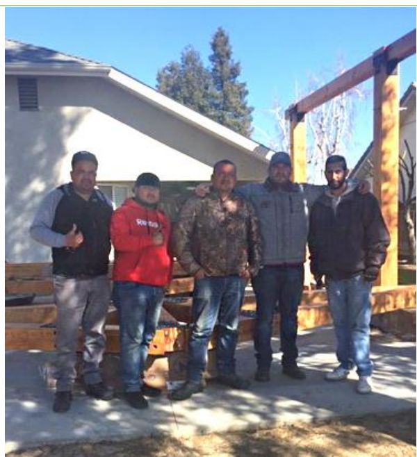
Some of the ugly guys from our install crew that will scare your children when they come install your order!