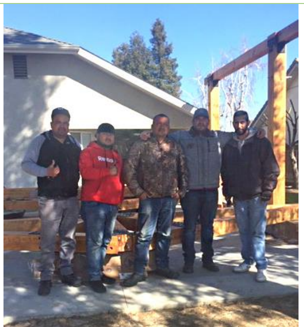
Some of the ugly guys from our install crew that will scare your children when they come install your order!