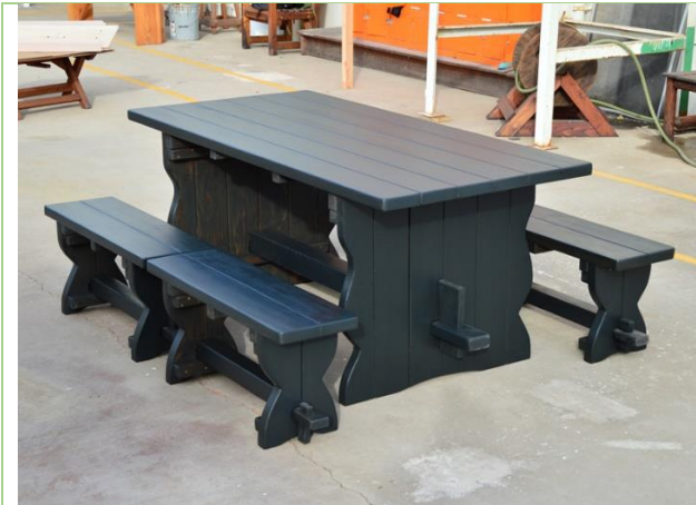
Here is how the Black Premium Stain looks like on Redwood