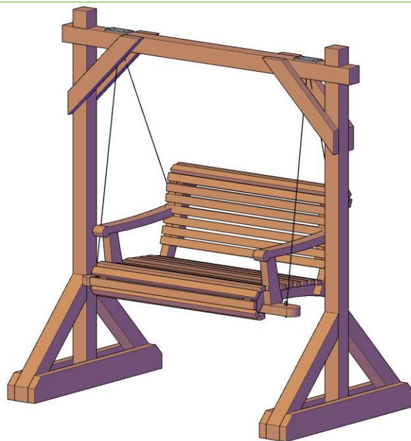
Bench Swing Sets without Roof