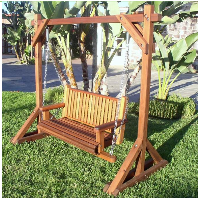
Bench Swing Sets without Roof