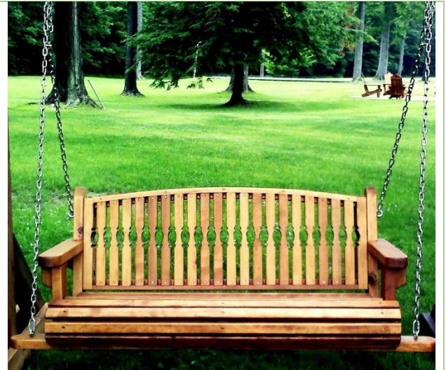
Kentucky Style Seat