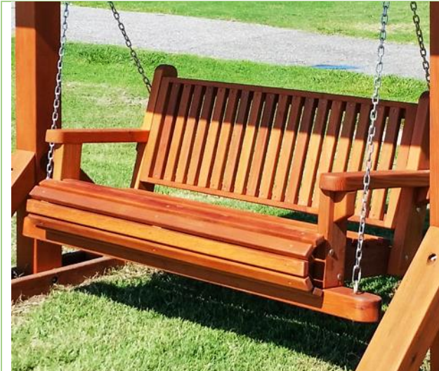
Classic Design Seat