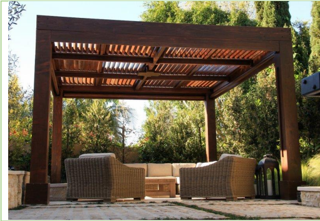
Here is how the Coffee Stain looks like on Redwood