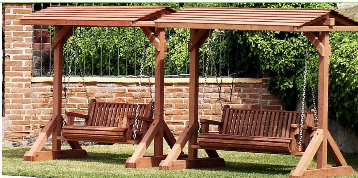
Bench Swing (seats 2 adults).