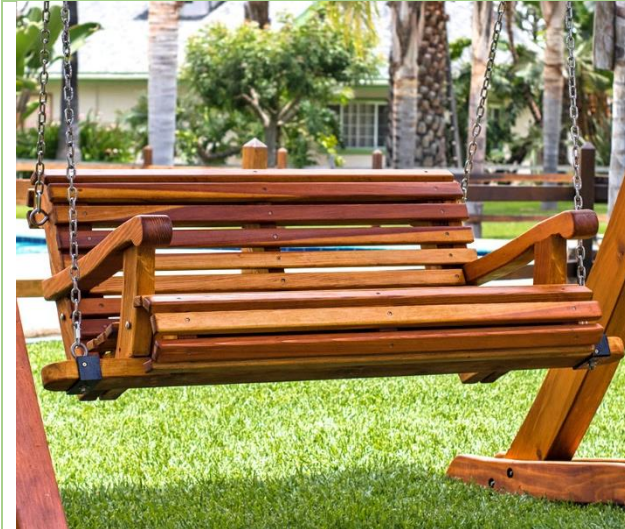
Ensenada Style Swing

We offer 4 styles: The Classic, The Ensenada, The Luna and The Kentucky. Four great designs for the same price: