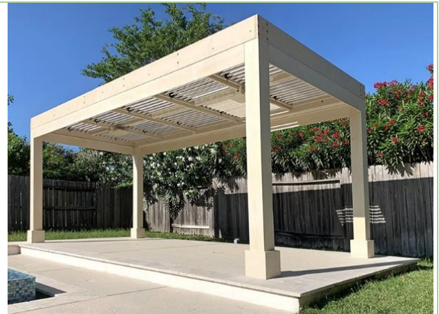
Here is how the White Wash looks like on Redwood