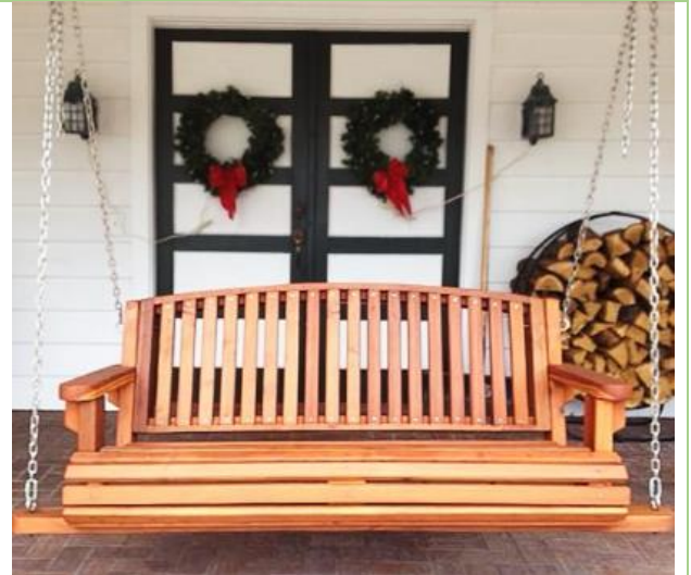
Luna Backrest Swing