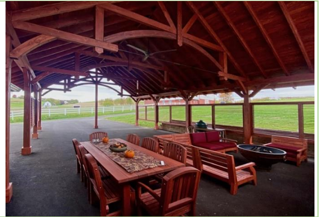
Here is how the Cherry Stain looks like on Redwood