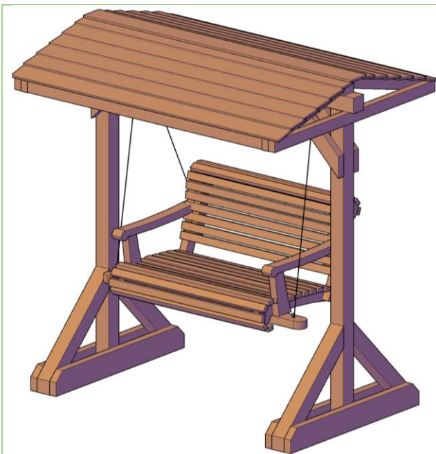
Bench Swing Sets with Roof