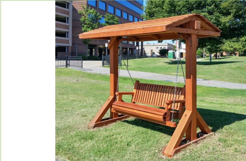
Bench Swing Sets with Roof

Enjoy a free-standing garden swing or porch swing with our sturdy redwood frame. The frame is made from full-dimension four-by-four timbers. The roof for all sizes extends thirty inches forward and thirty inches back to provide total shade.