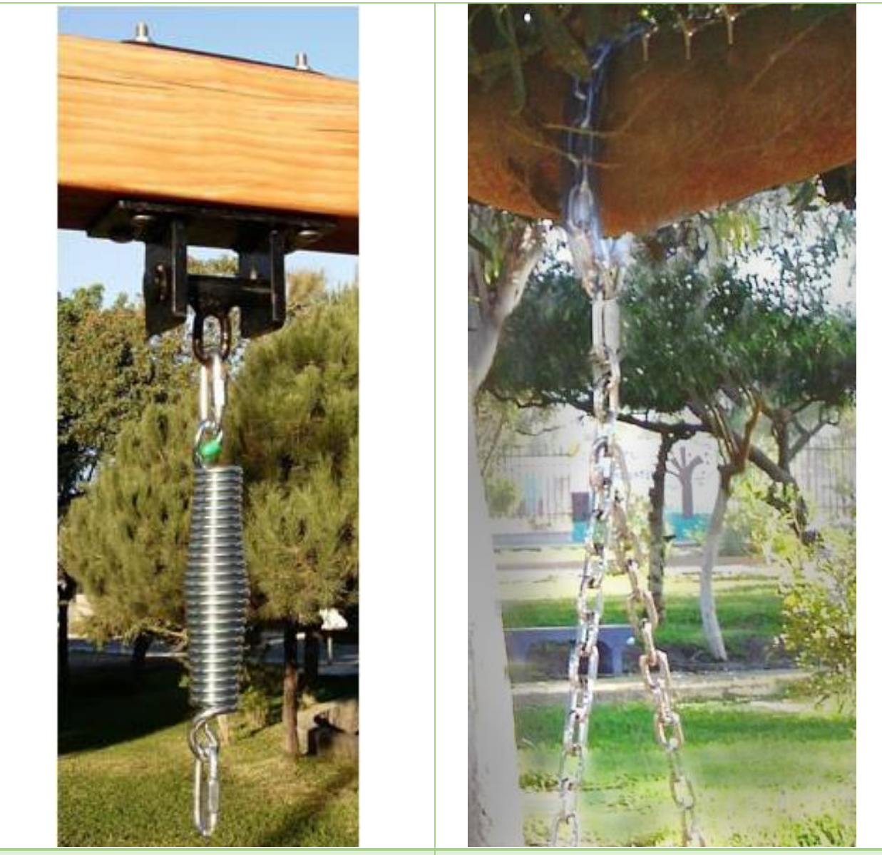
All Stainless Steel Hanging Hardware to attach to beam. (pivoting steel hangars, chain, seat eyebolts, springs & ulinks). When you make an order please write in height and diagonal width of your beam in comment section

We ship 1/4" thick stainless steel chain assuming your beam or tree branch is 10 ft off the ground. If you need more chain because your beam or branch is more than 10 ft. off the ground, please make a note in the comment section at checkout. There is an additional charge for extra chain. If your beam or branch is less than 10 ft off the ground, please let us know the distance so we do not send extra chain unnecessarily. Thank you.