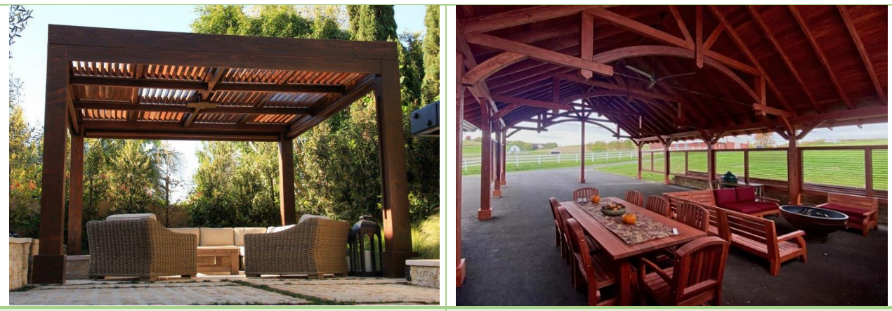
Here is how the Coffee Stain looks like on Redwood