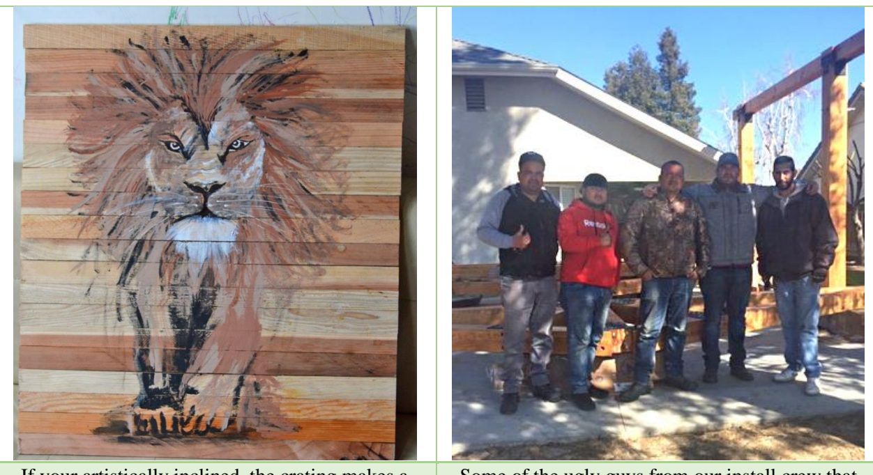
If your artistically inclined, the crating makes a great canvas to: Lion of the Tribe of Juda by Patricia Vallejo

Assembly Service Available Nationwide: All orders over $3,000. in size can choose to have Forever Redwood assemble for you. Just choose White Glove Service in the Shopping Cart or at Checkout. For more information on White Glove, please go to: <u>WHITE GLOVE</u>.