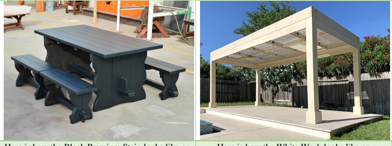
Here is how the Black Premium Stain looks like on Redwood