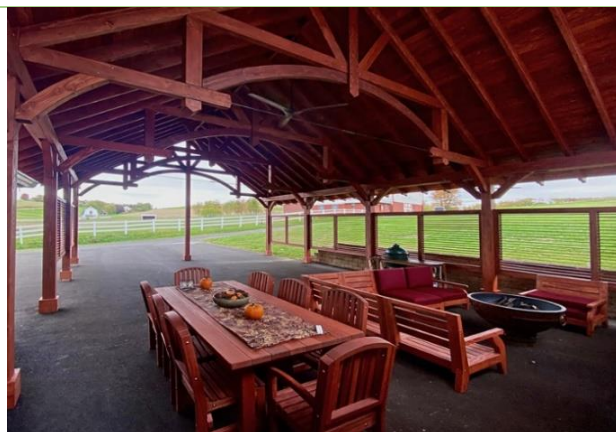
Here is how the Cherry Stain looks like on Redwood