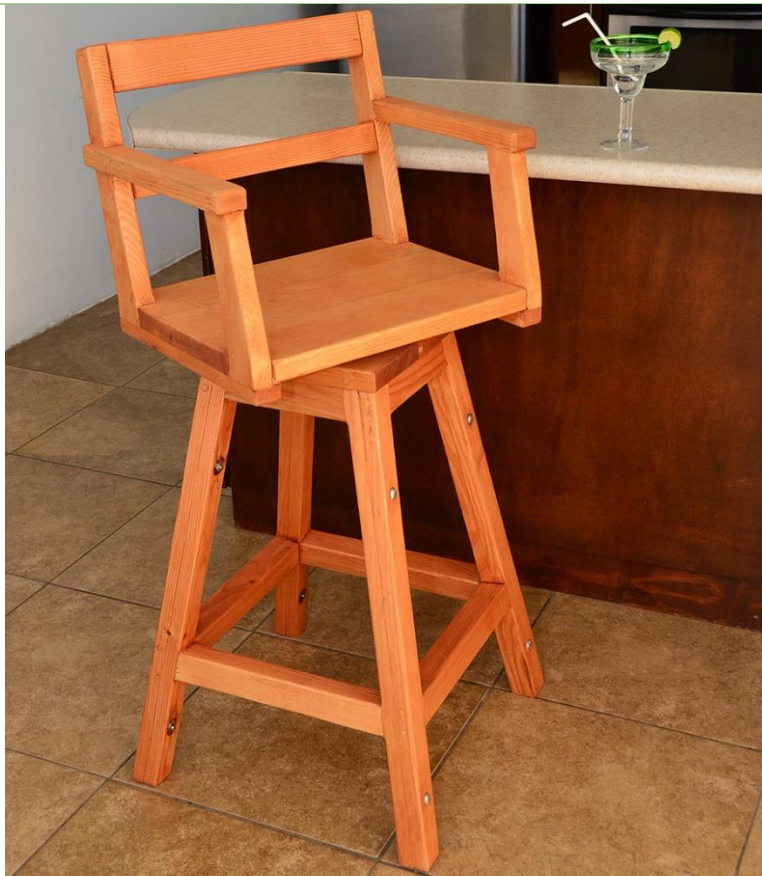
Swivel Bar Stool

You can also order the swivel option on your Cocktail Bar Stools or delete it for minor price reduction.