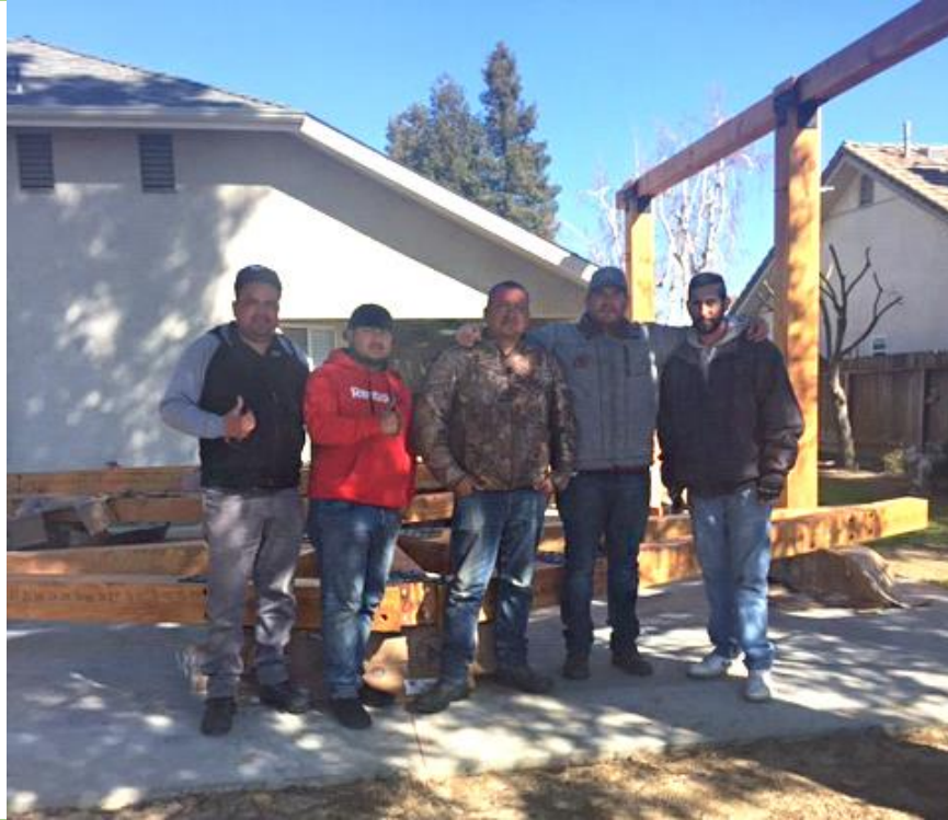
Some of the ugly guys from our install crew that will scare your children when they come install your order!