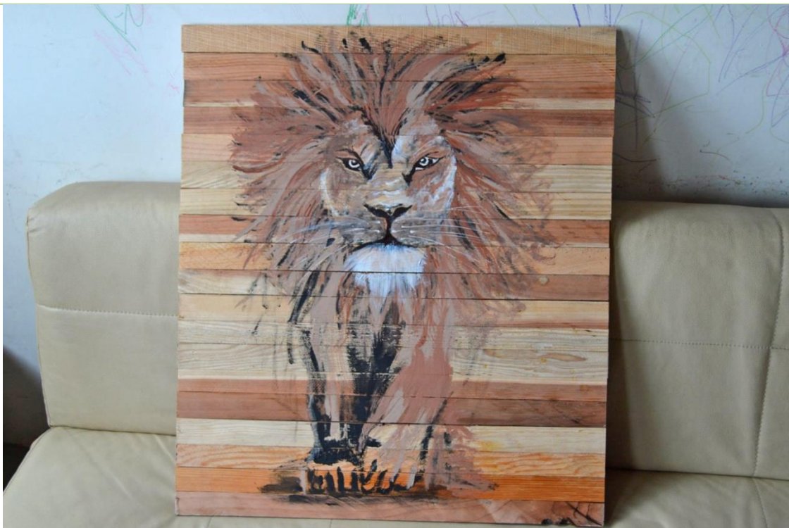
If your artistically inclined, the crating makes a great canvas to: Lion of the Tribe of Juda by Patricia Vallejo

Assembly Service Available Nationwide: All orders over $3,000. in size can choose to have Forever Redwood assemble for you. Just choose White Glove Service in the Shopping Cart or at Checkout. For more information on White Glove, please go to: WHITE GLOVE COMPLETE ASSEMBLY SERVICE