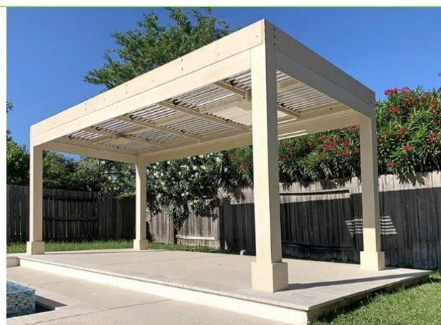
Here is how the White Wash looks like on Redwood