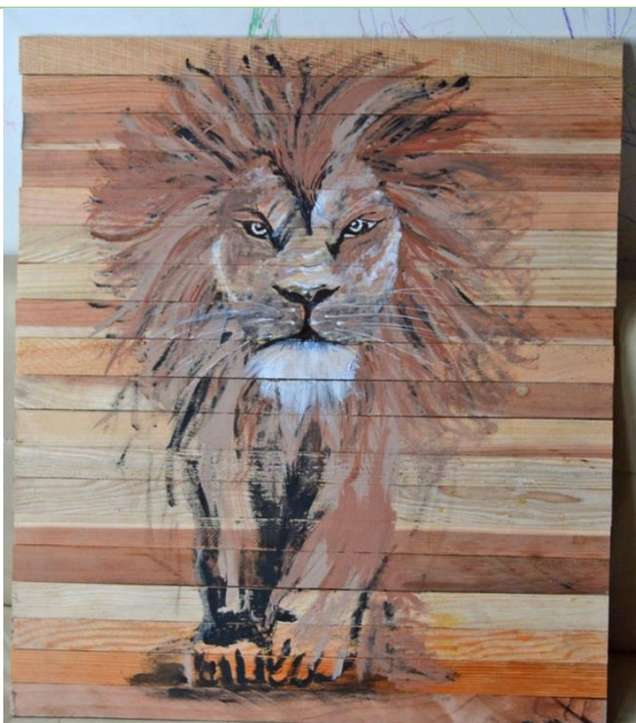
If your artistically inclined, the crating makes a great canvas to: Lion of the Tribe of Juda by Patricia Vallejo

Assembly Service Available Nationwide: All orders over $3,000. in size can choose to have Forever Redwood assemble for you. Just choose White Glove Service in the Shopping Cart or at Checkout. For more information on White Glove, please go to: WHITE GLOVE .