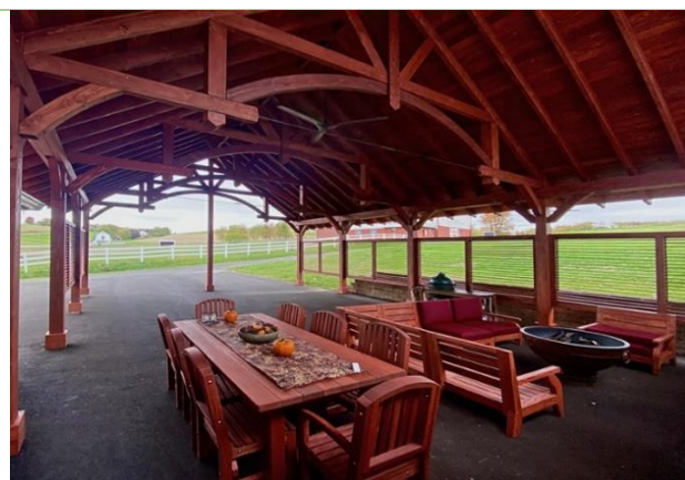
Here is how the Cherry Stain looks like on Redwood