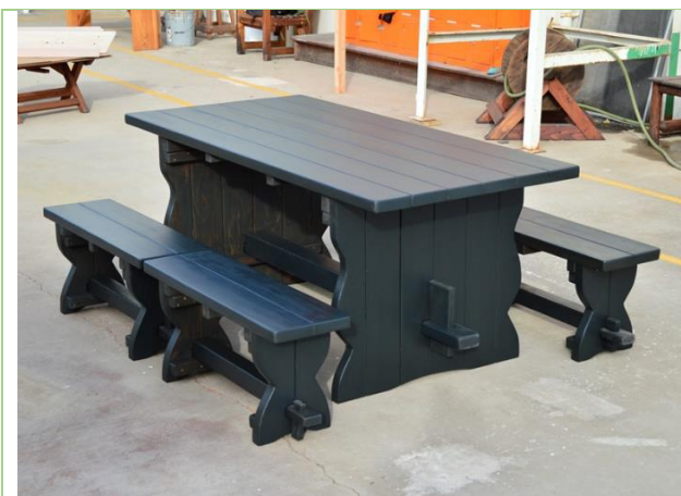
Here is how the Black Premium Stain looks like on Redwood