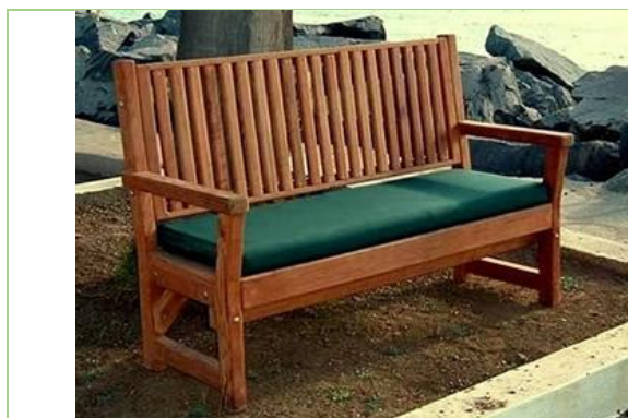
Massive Garden Bench with Cushion