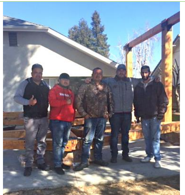
Some of the ugly guys from our install crew that will scare your children when they come install your order!