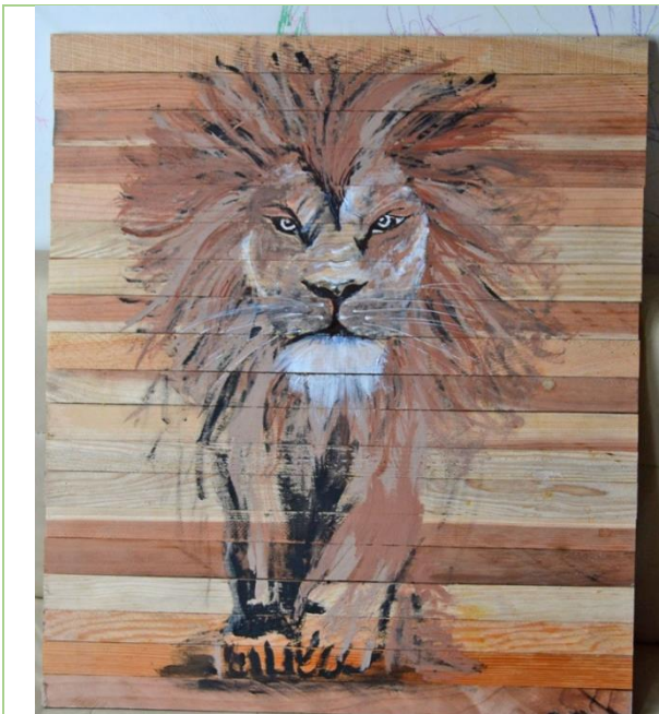
If your artistically inclined, the crating makes a great canvas to: Lion of the Tribe of Juda by Patricia Vallejo

Assembly Service Available Nationwide: All orders over $3,000. in size can choose to have Forever Redwood assemble for you. Just choose White Glove Service in the Shopping Cart or at Checkout. For more information on White Glove, please go to: WHITE GLOVE .