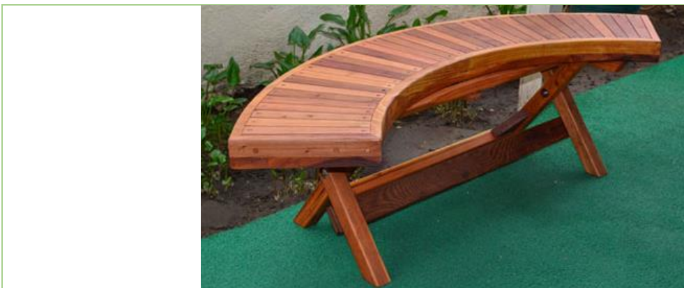
Folding Arc Bench

Folding Arc Benches accompany our Karyn's tables.