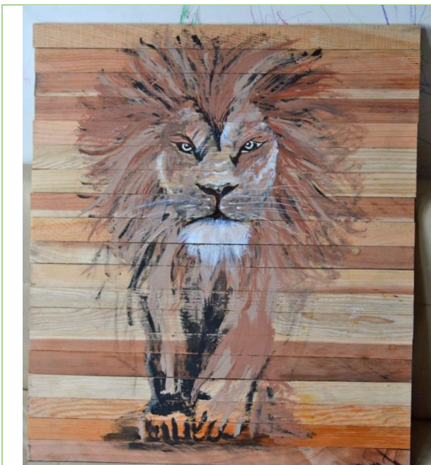
If your artistically inclined, the crating makes a great canvas to: Lion of the Tribe of Juda by Patricia Vallejo

Assembly Service Available Nationwide: All orders over $3,000. in size can choose to have Forever Redwood assemble for you. Just choose White Glove Service in the Shopping Cart or at Checkout. For more information on White Glove, please go to: WHITE GLOVE .