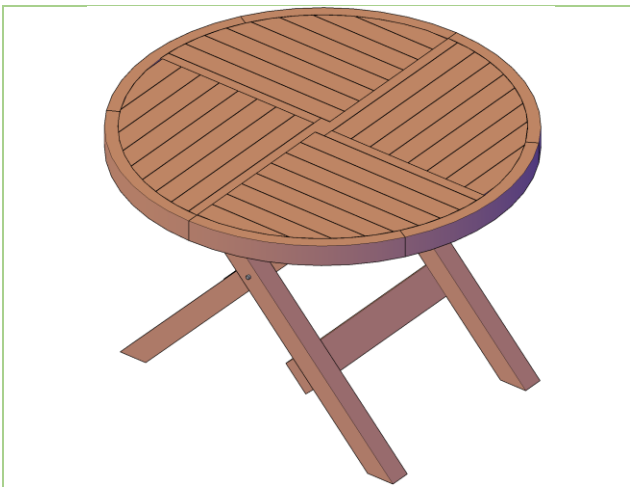
Checkerboard Style Bench and Table (Most popular)