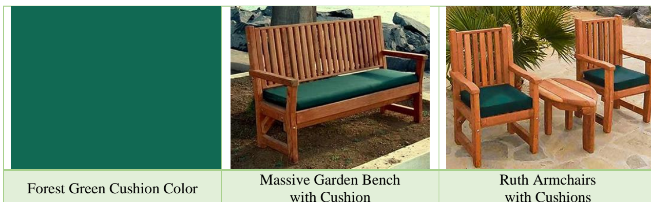
Forest Green Cushion Color

If you'd like a cushion for your chairs, please indicate this in the Advanced Options section. Standard cushions come in forest green however you also have the option to visit Trivantage to choose from the hundreds of outdoor fabrics they have for your cushion.