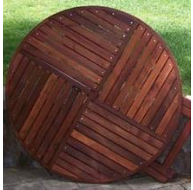
Standard Tabletop (Recommended & Most Popular Outdoors)

Ideal for use in a covered patio or indoors. It can be taken outdoors for a meal or party but isn't designed for outdoor living. The seamless construction creates a beautiful unbroken tabletop surface that is just as strong as our standard tabletop.