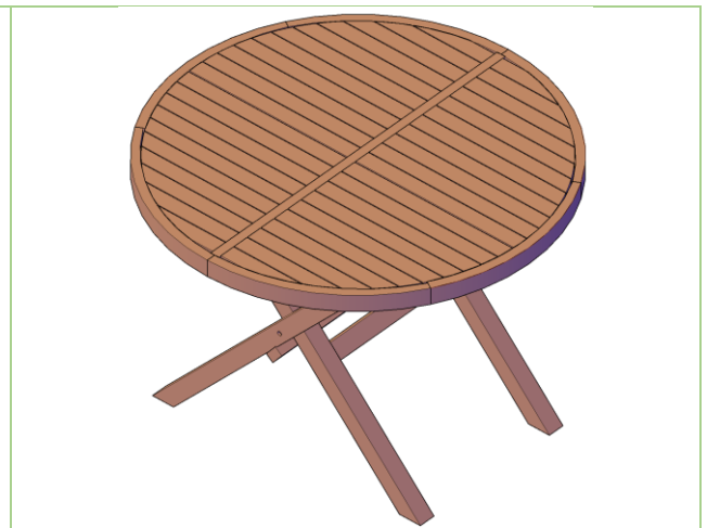
Boards All in Same Direction Style