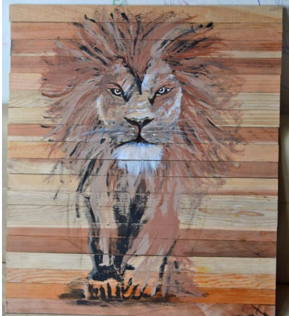
If your artistically inclined, the crating makes a great canvas to: Lion of the Tribe of Juda by Patricia Vallejo

Assembly Service Available Nationwide: All orders over $3,000. in size can choose to have Forever Redwood assemble for you. Just choose White Glove Service in the Shopping Cart or at Checkout. For more information on White Glove, please go to: WHITE GLOVE COMPLETE ASSEMBLY SERVICE