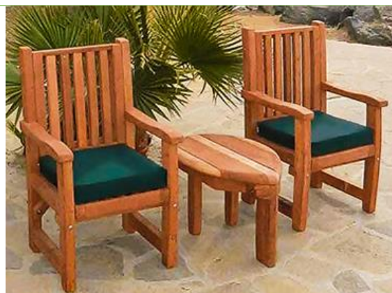
Ruth Armchairs with Cushions

The most popular fabric choice over the years is the Forest Green. For this reason, we've made it our default fabric choice for all cushions. If you'd like a cushion in a color or pattern other than Forest Green, you can choose from thousands of fabrics by visiting our Sunbrella fabric partner Trivantage Upholstery Fabric at: https://www.trivantage.com/fabric-upholstery .