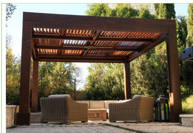
Here is how the Coffee Stain looks like on Redwood