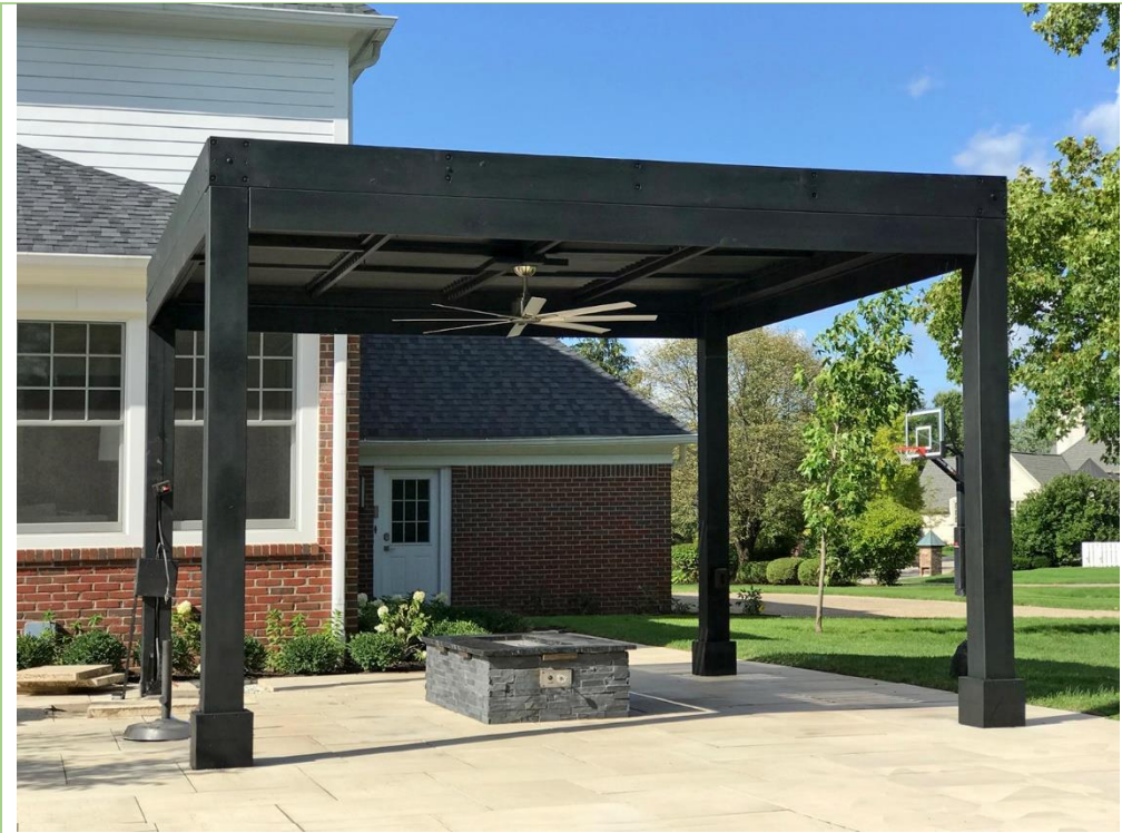
Modern Louvered Pergola – Black Stain