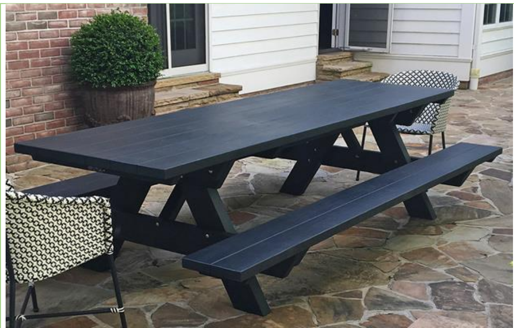
Benjamin Moore: Black Stain, 2131-10

First select the type of paint you want: Benjaminmoore.com