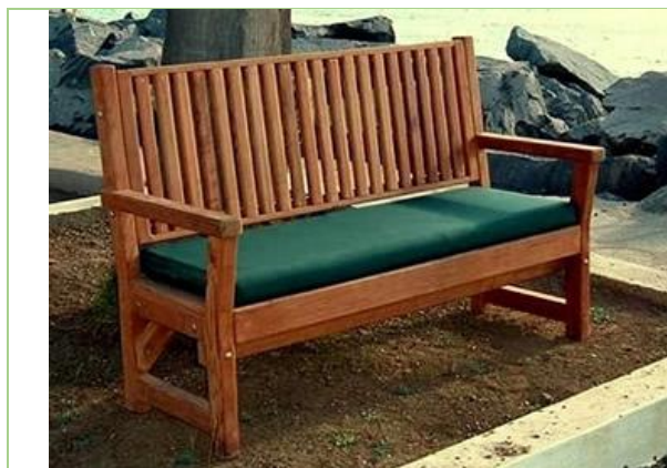
Massive Garden Bench with Cushion