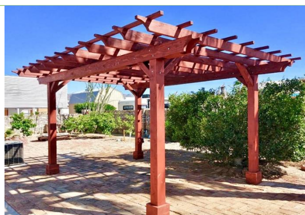
Here is how the Cherry Stain looks like on Redwood