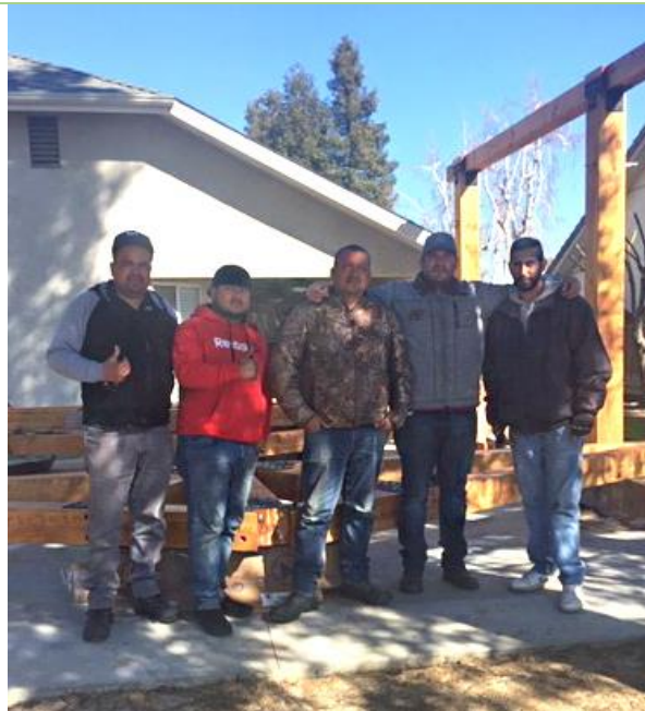
Some of the ugly guys from our install crew that will scare your children when they come install your order!