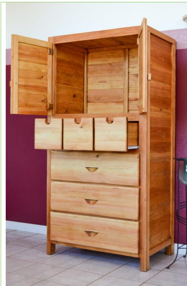
No Removable Shelf

Add a 15" deep removable shelf in the main compartment for only $40. Removable shelf is normally placed in the center of the main compartment. If you prefer it lower or higher than the center, just let us know. This option is available in Advanced Options.