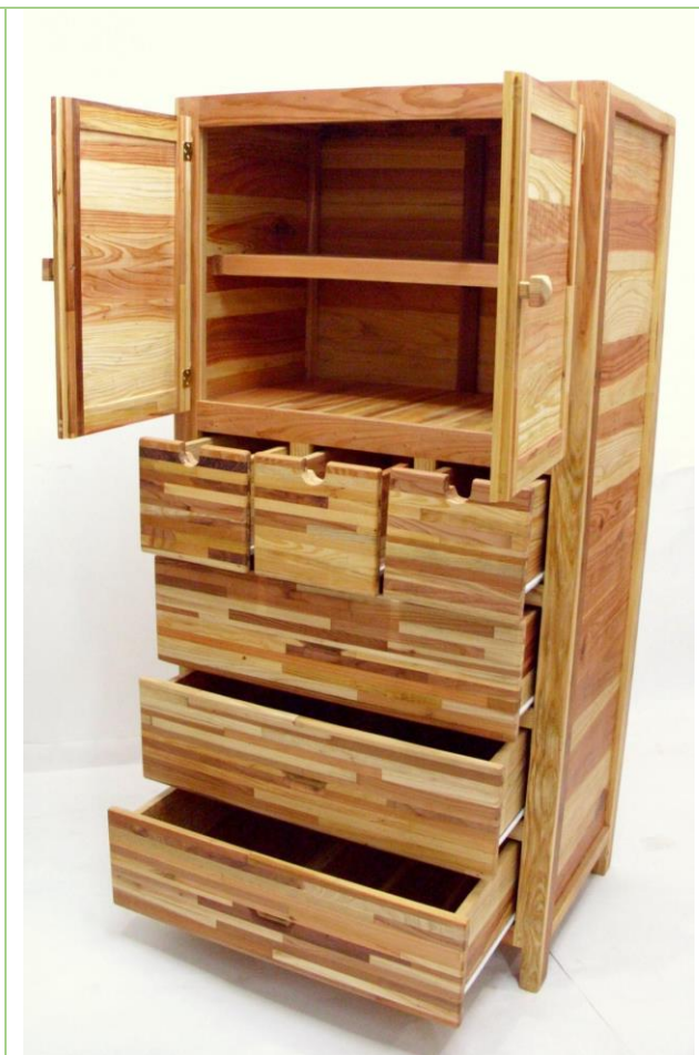
With Removable Shelf