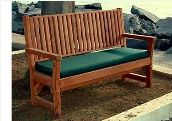
Massive Garden Bench with Cushion