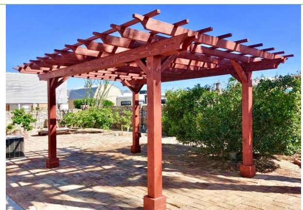
Here is how the Cherry Stain looks like on Redwood