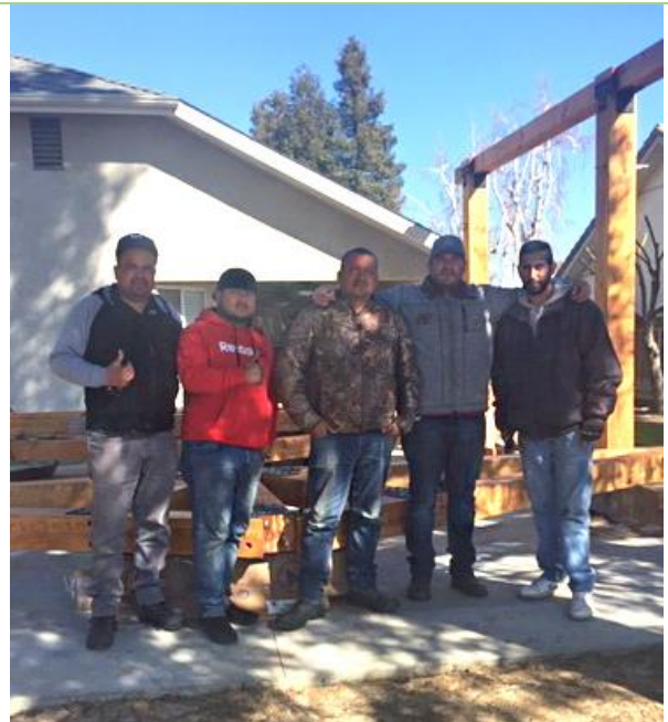
Some of the ugly guys from our install crew that will scare your children when they come install your order!