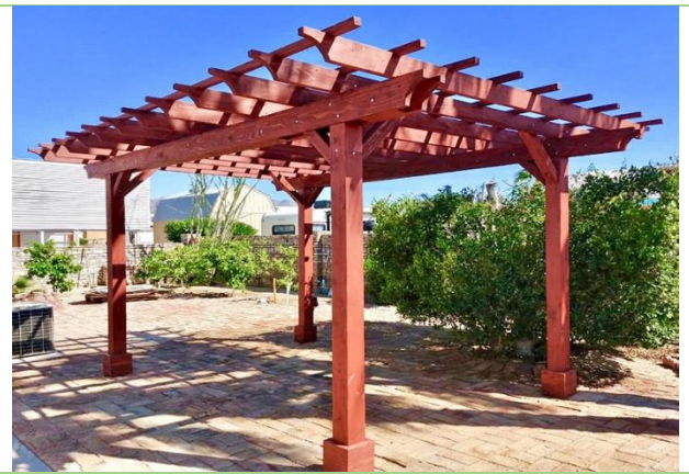
Here is how the Cherry Stain looks like on Redwood