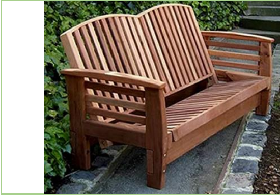
Standard Double Arched Backrest (Most Popular)