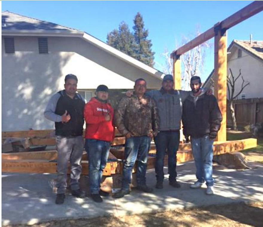
Some of the ugly guys from our install crew that will scare your children when they come install your order!