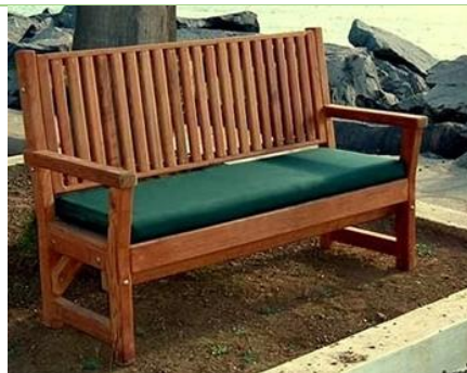
Massive Garden Bench with Cushion