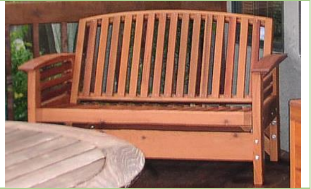
Single Arch Backrest