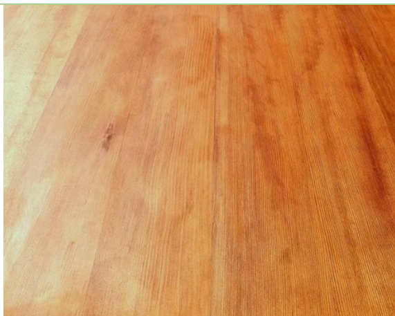
Seamless Tabletop (Most Popular Indoors)

Ideal for use in a covered patio or indoors. It can be taken outdoors for a meal or party but isn't designed for outdoor living. The seamless construction creates a beautiful unbroken tabletop surface that is just as strong as our standard tabletop.