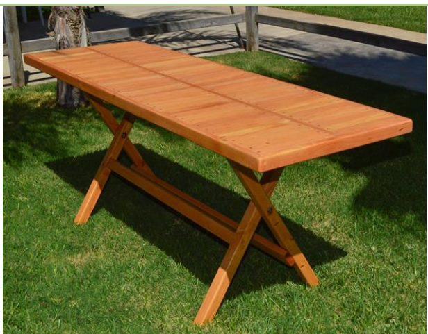
Boards All in Same Direction Style