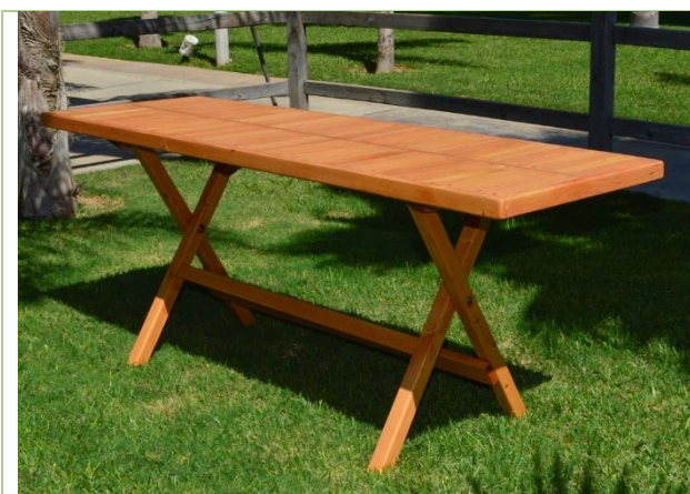
Folding Table Only

Folding chairs accompany all our folding tables. For bench seating, the tables come with our Folding Benches.