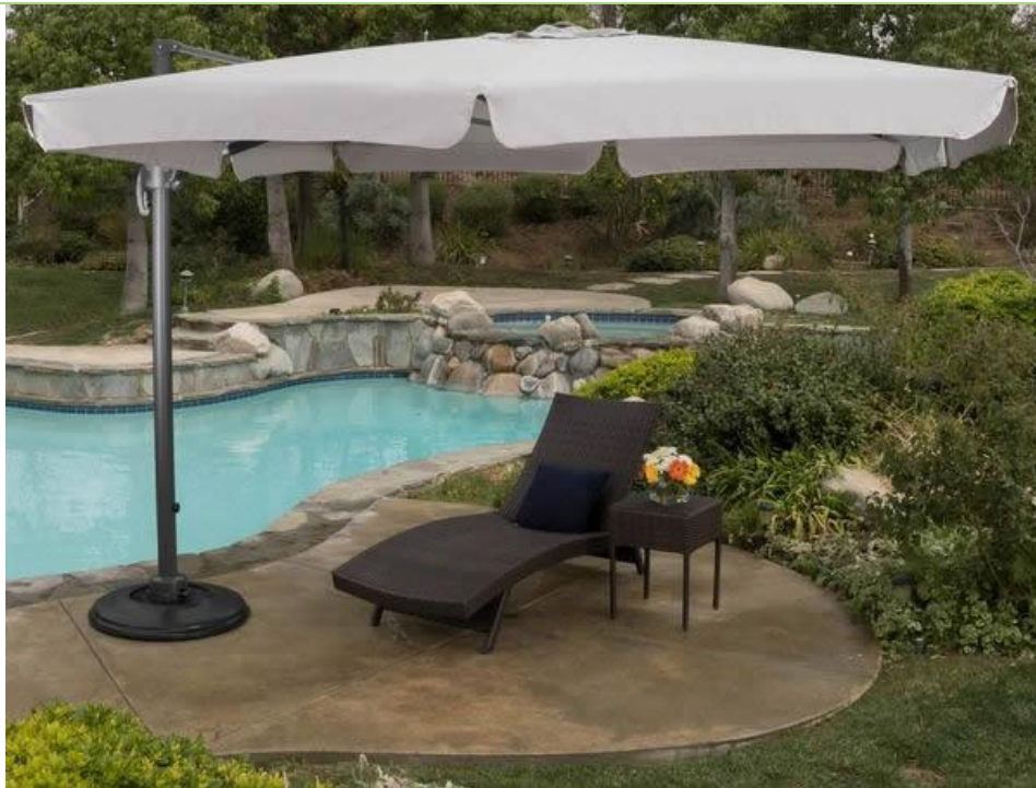
For Rectangular Shaped Tables.

Many customers prefer to use Umbrellas that are not placed over the table using an umbrella hole. For example: