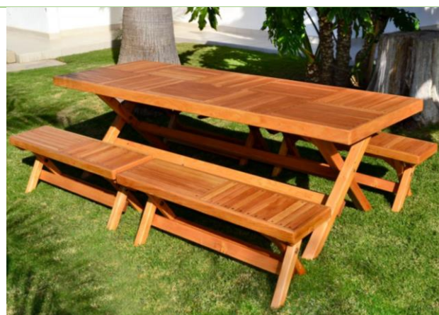
Folding Table with Benches