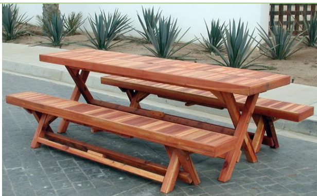
Full Length Bench per Side

For the larger folding tables, we offer the option of two half-length folding benches/side or one full length folding bench/side for additional seating flexibility. So you have the option of ordering your table with 2 full length benches or with a total of 4 benches that are half the length of the tabletop at no extra cost.