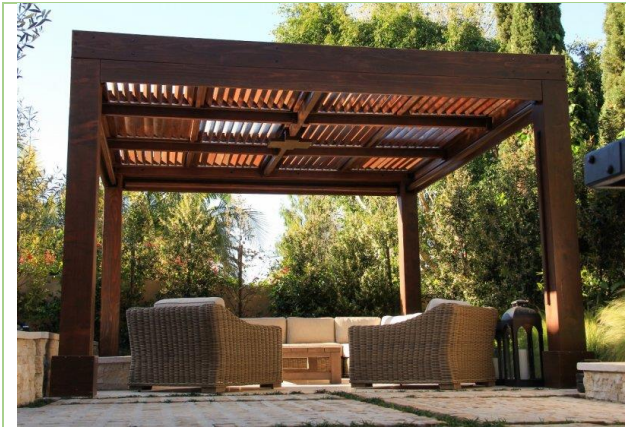
Here is how the Coffee Stain looks like on Redwood