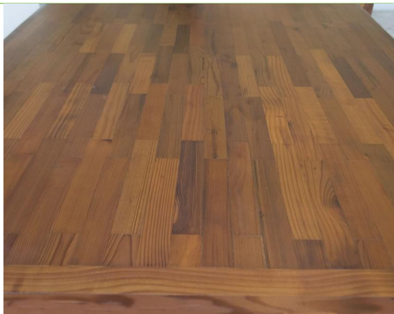
Parquet Tabletop Style

Recommended for tables to be left out in the weather. Outdoor tabletop boards need "breathing" room to expand and contract to the constant changes in moisture and temperature. The standard tabletop boards are separated by 1/16-inch to allow for this movement.