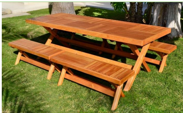
2 Half Length Benches per Side