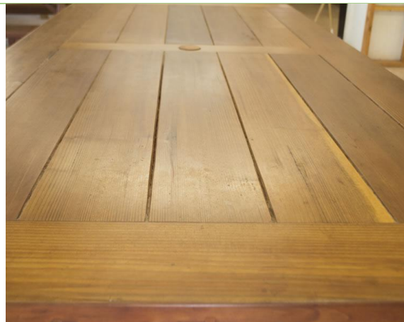
Old Country Tabletop Style

A seamless design made with contrasting blocks of varying wood grades to create a beautiful tapestry of color and wood grains. Designed primarily for indoor use, the Parquet table can be taken out for short stints outdoors. Its seamless design makes it ideal for a covered patio or indoor use year round. Any benches for a table set will be in matching parquet bench tops by default. If you prefer benches in a different design, just let us know . The parquet pieces will be naturally varied in color as shown.