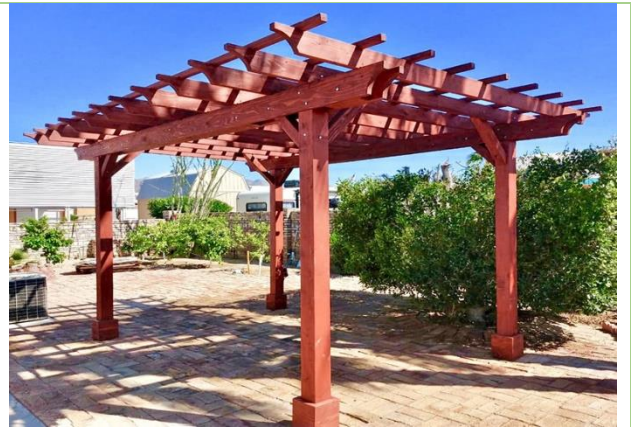
Here is how the Cherry Stain looks like on Redwood