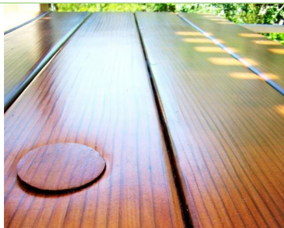
Standard Tabletop (Recommended & Most Popular Outdoors)

Ideal for use in a covered patio or indoors. It can be taken outdoors for a meal or party but isn't designed for outdoor living. The seamless construction creates a beautiful unbroken tabletop surface that is just as strong as our standard tabletop.