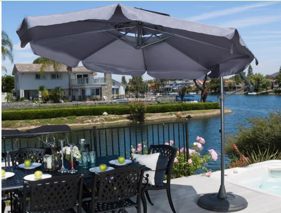
For Round Tables.