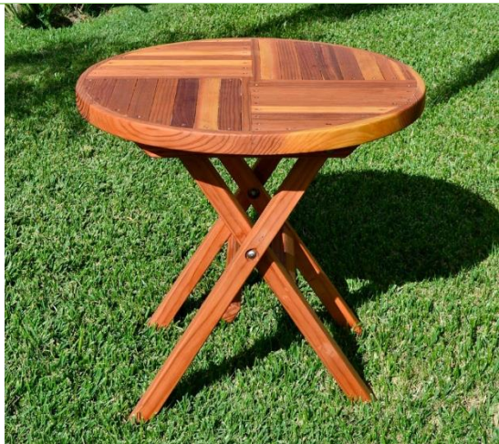
Folding Table Only

Folding chairs accompany all our folding tables. For bench seating, the tables come with our Folding Benches.