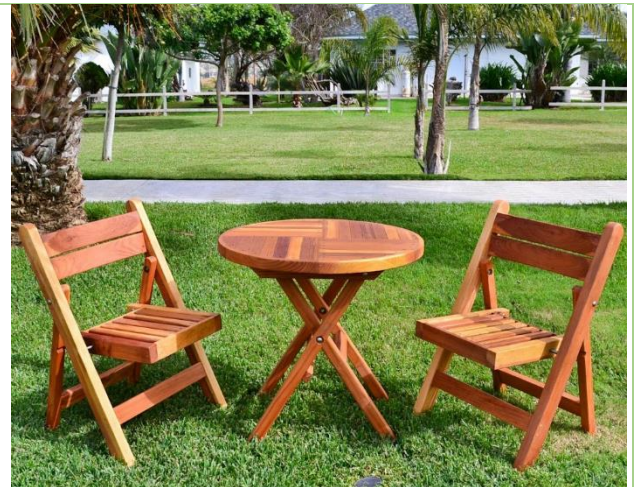
Folding Table with Chairs