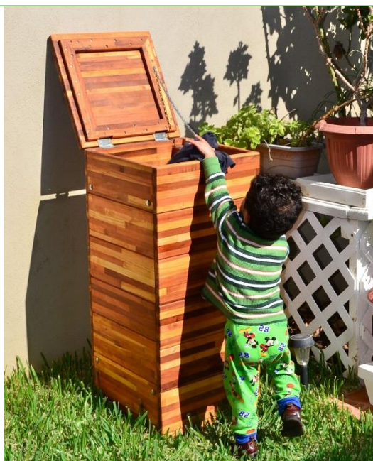
Attached with stainless steel hinges and piston system.