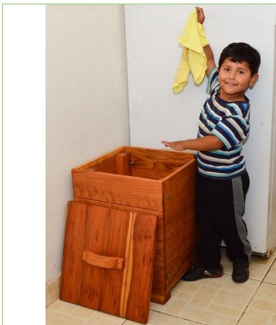
Unattached to Receptable