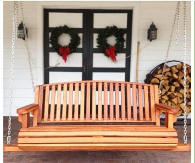
Luna Backrest Swing