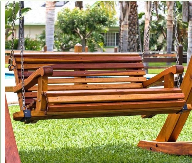
Ensenada Style Swing

We offer 4 styles: The Classic, The Ensenada, The Luna and The Kentucky. Four great designs for the same price: