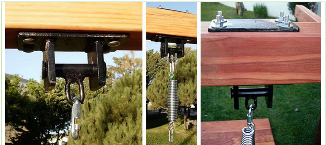
Stainless Steel Hanging Hardware to attach to Beam (Eyebolts, quick links, springs & pivoting steel hangers).

We ship springs with each swing set. The springs allow the seat to give just a bit and is a favorite of many customers. The springs are easily added and removed depending on whether you like the softness it adds to the ride.