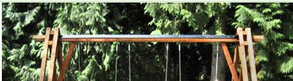
Steel Beam Reinforcement

Available for additional structural reinforcement for Rory's Giant 3-Person Swing is a 1/4" thick steel beam. It sits atop the entire length of the 6 x 6 main timber and wraps around both the front and rear for additional long-term structural strength. The steel beam is not needed for normal long-term use; it was developed for commercial installations, but has been ordered occasionally for private family applications where on-going rambunctious behavior is anticipated. The steel beam is primed and painted black (oil based paint) and comes with all the stainless steel bolts needed to firmly secure it to the main beam.