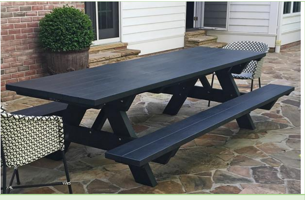
Benjamin Moore: Black Stain, 2131-10

First select the type of paint you want: Benjaminmoore.com