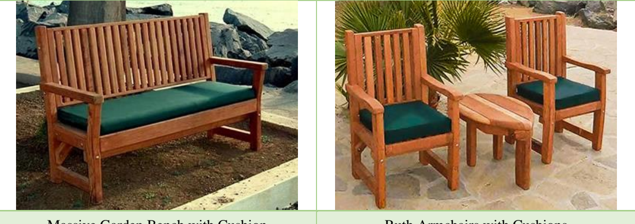
Massive Garden Bench with Cushion