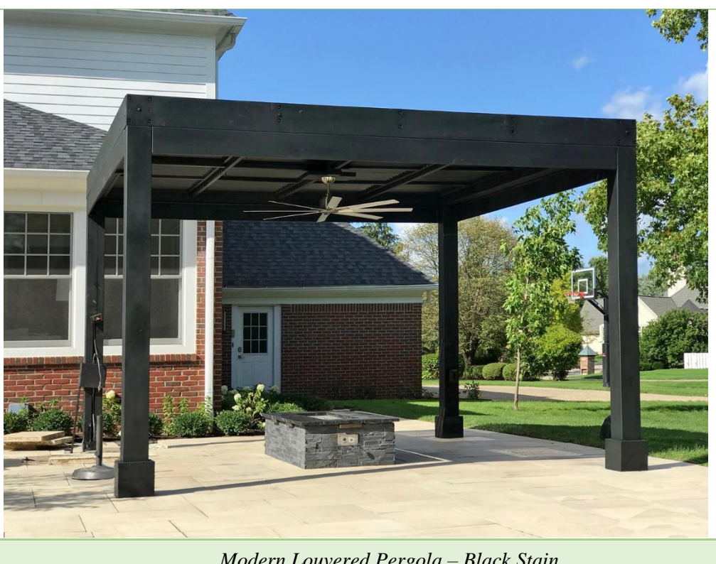
Modern Louvered Pergola – Black Stain