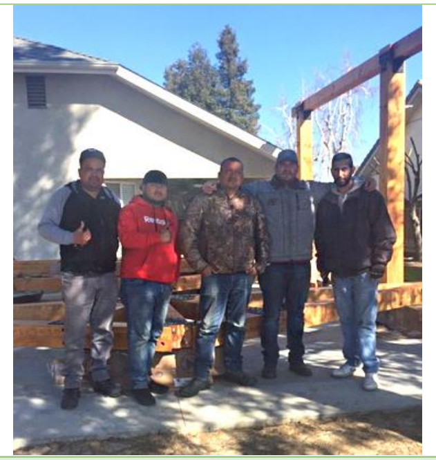
Some of the ugly guys from our install crew that will scare your children when they come install your order!