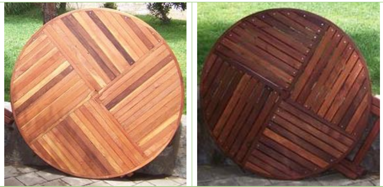
Seamless Tabletop (Most Popular Indoors)

Ideal for use in a covered patio or indoors. It can be taken outdoors for a meal or party but isn't designed for outdoor living. The seamless construction creates a beautiful unbroken tabletop surface that is just as strong as our standard tabletop.