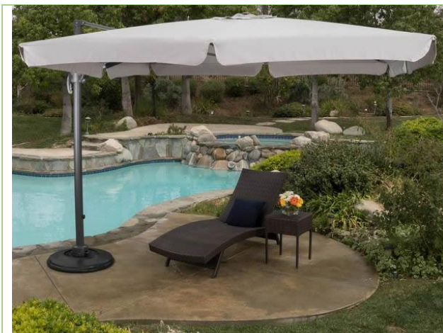
For Rectangular Shaped Tables.

Many customers prefer to use Umbrellas that are not placed over the table using an umbrella hole. For example: