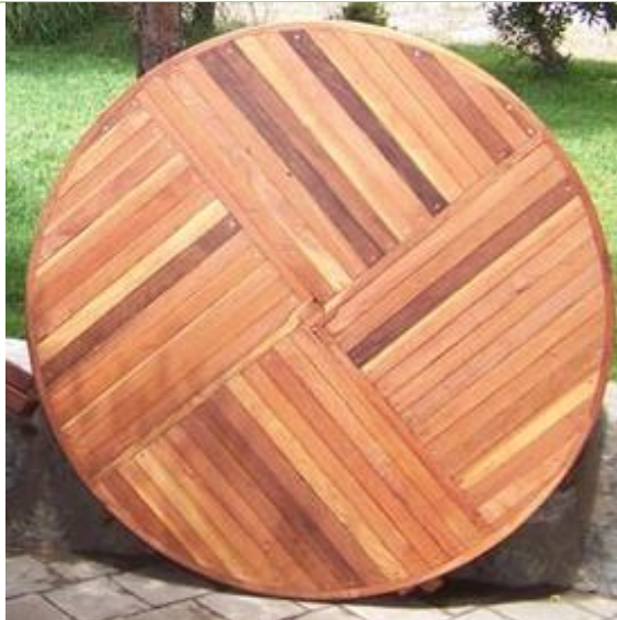
Seamless Tabletop (Most Popular Indoors)

Select tables also offer tabletops in the following additional styles: