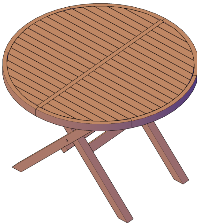
Boards All in Same Direction Style