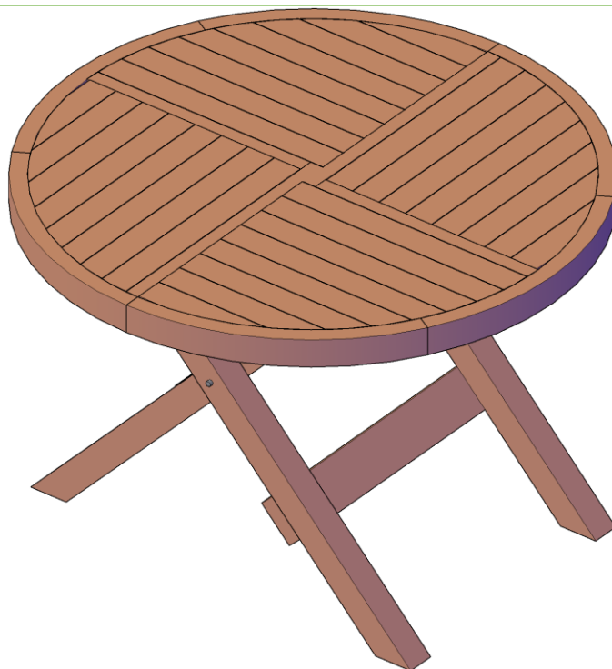
Checkerboard Style Bench and Table (Most popular)