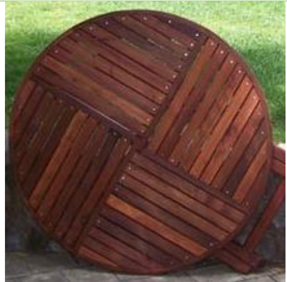
Standard Tabletop (Recommended & Most Popular Outdoors)

Ideal for use in a covered patio or indoors. It can be taken outdoors for a meal or party but isn't designed for outdoor living. The seamless construction creates a beautiful unbroken tabletop surface that is just as strong as our standard tabletop.