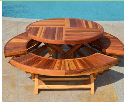
Folding Table with Benches