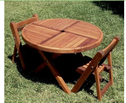
Folding Table with Chairs