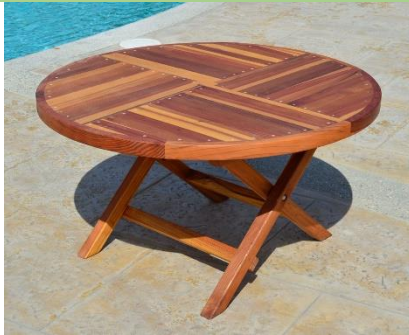
Folding Table Alone

Kid's Round Folding tables are available with chairs, benches and alone.