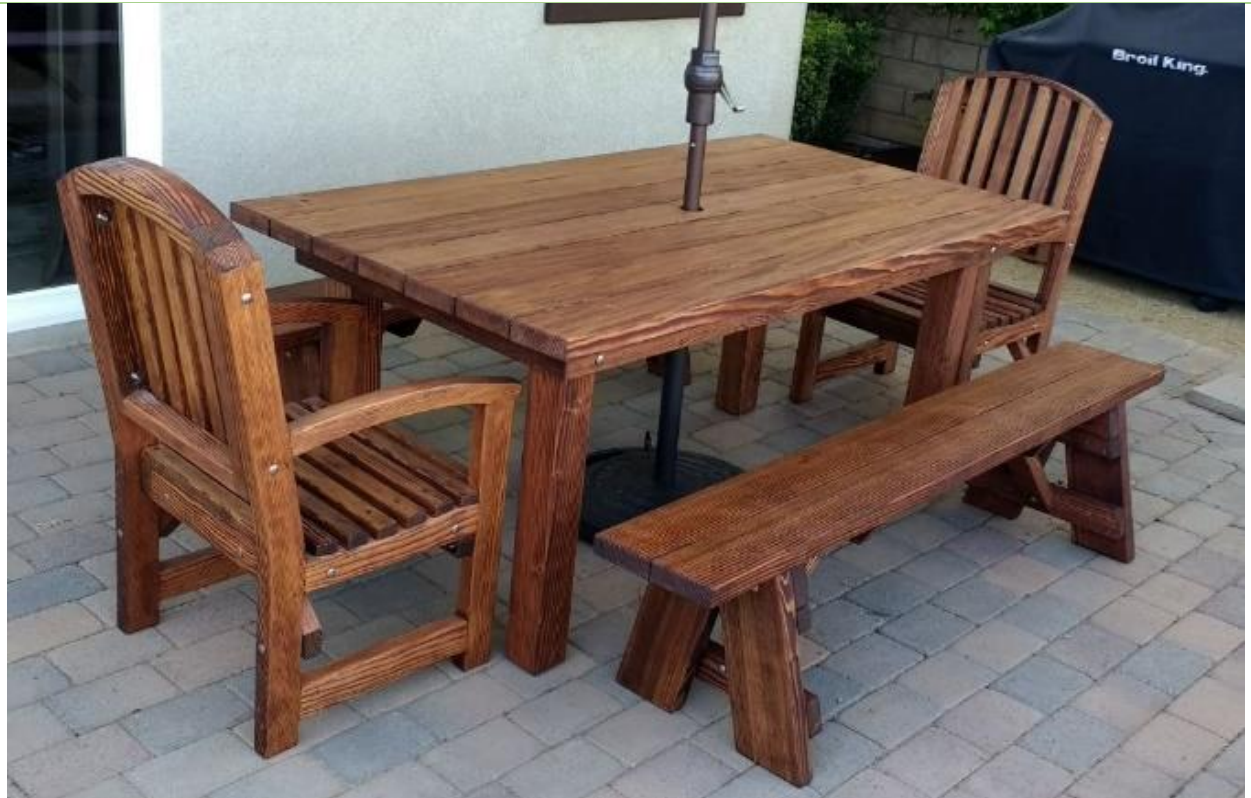
Tiger Stripe Effect

Douglas-Fir when stained dark creates a "tiger stripe" effect as shown in this photo. It is beautiful and most customers love it. If you are looking for a dark consistent stain and do not want to see a "tiger stripe effect", please go with any of the Redwood grades for a more consistent stain finish.