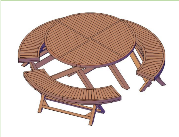
3 Folding Arc Benches