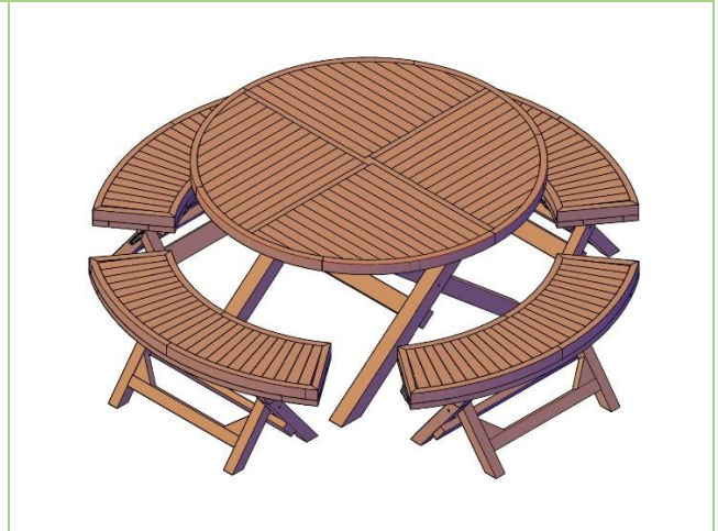
4 Folding Arc Benches