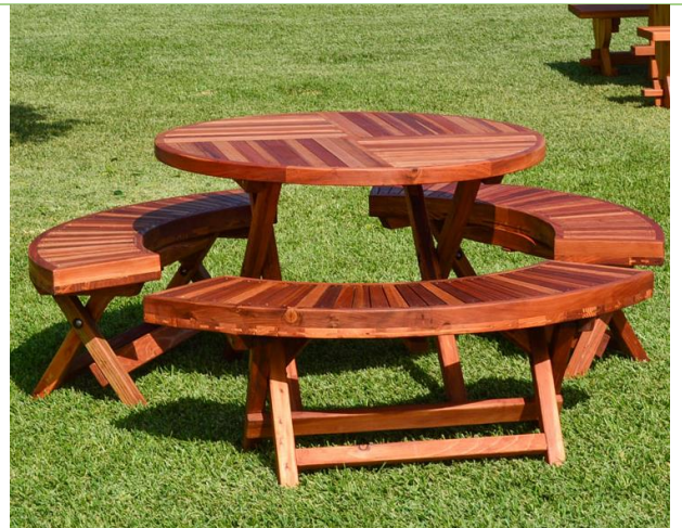
Folding Table with Benches