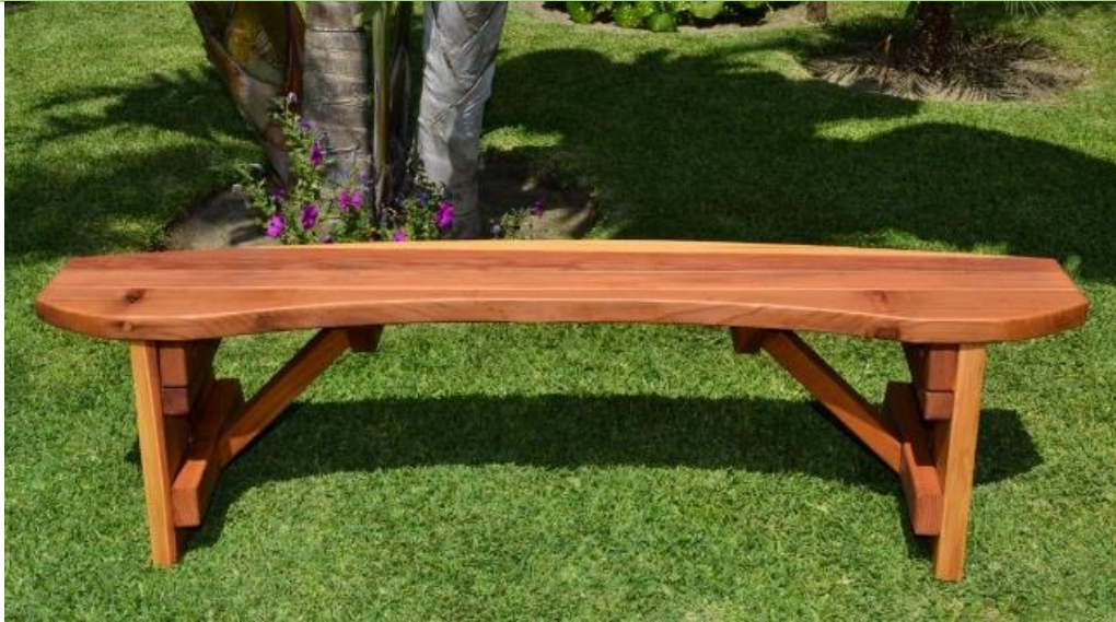
Round Picnic Bench (Default)