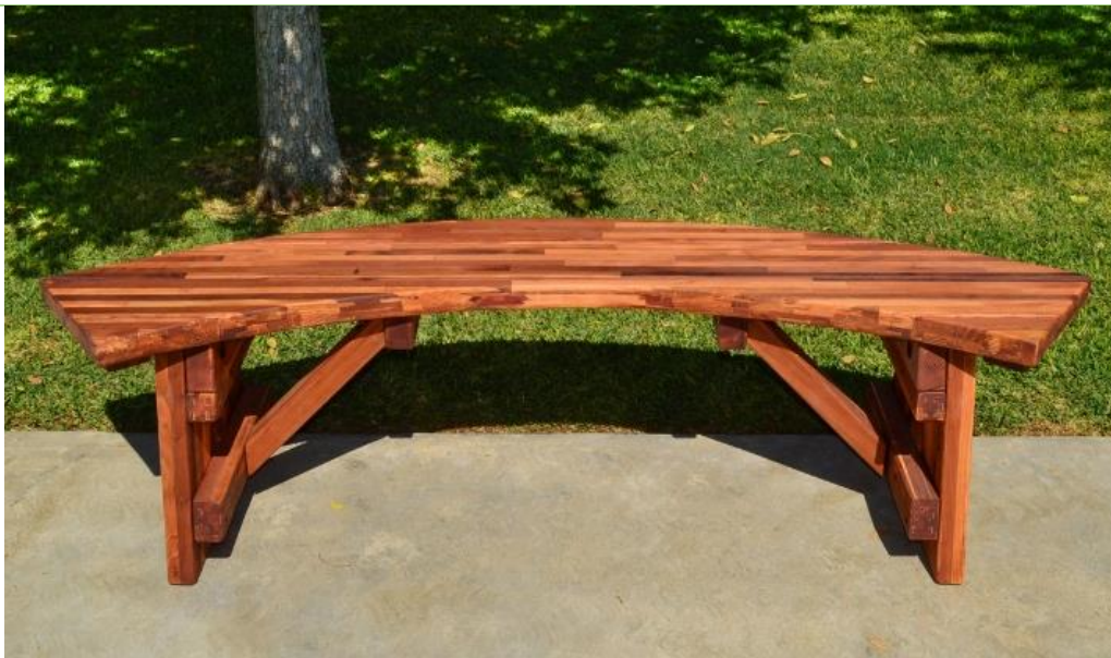
Arc Picnic Bench