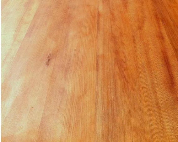
Seamless Tabletop (Most Popular Indoors)

Ideal for use in a covered patio or indoors. It can be taken outdoors for a meal or party but isn't designed for outdoor living. The seamless construction creates a beautiful unbroken tabletop surface that is just as strong as our standard tabletop.