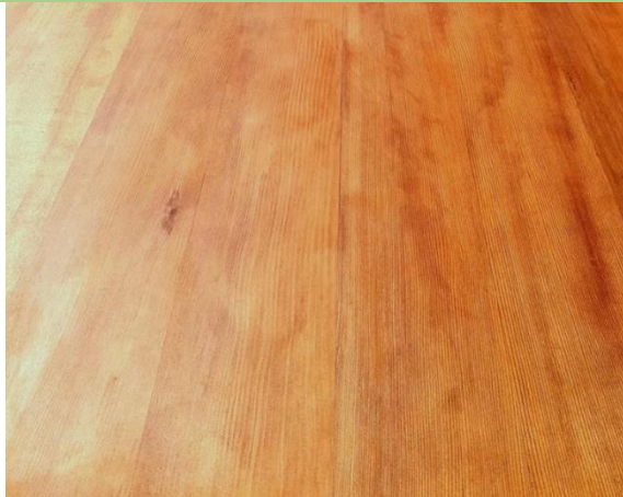
Seamless Tabletop (Most Popular Indoors)

Ideal for use in a covered patio or indoors. It can be taken outdoors for a meal or party but isn't designed for outdoor living. The seamless construction creates a beautiful unbroken tabletop surface that is just as strong as our standard tabletop.