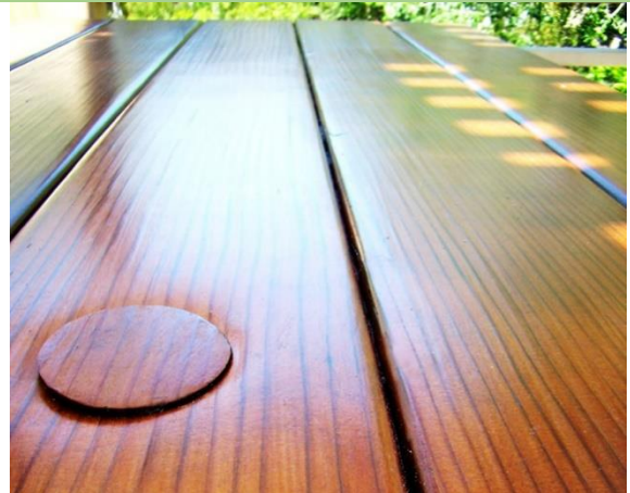
Standard Tabletop (Recommended & Most Popular Outdoors)

Ideal for use in a covered patio or indoors. It can be taken outdoors for a meal or party but isn't designed for outdoor living. The seamless construction creates a beautiful unbroken tabletop surface that is just as strong as our standard tabletop.