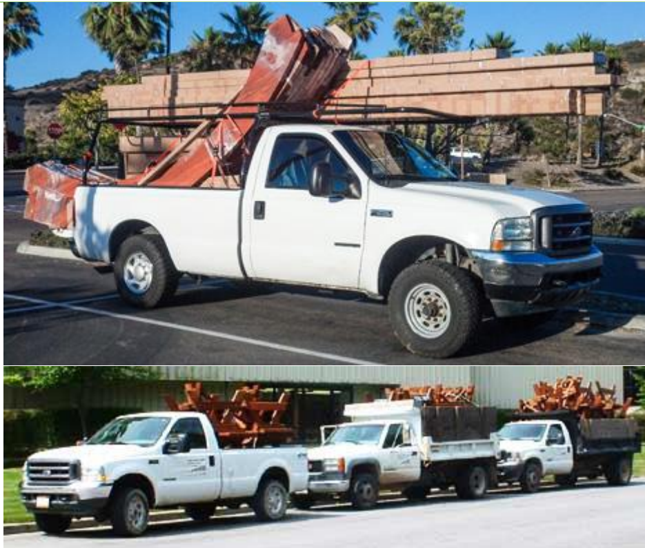
Our trucks loaded and ready to deliver to you!

Forever Redwood uses 100% recycled wood and cardboard in all packaging. We use our shop scraps to build crate panels (see photos below). Please help by reusing or disposing of these items responsibly.