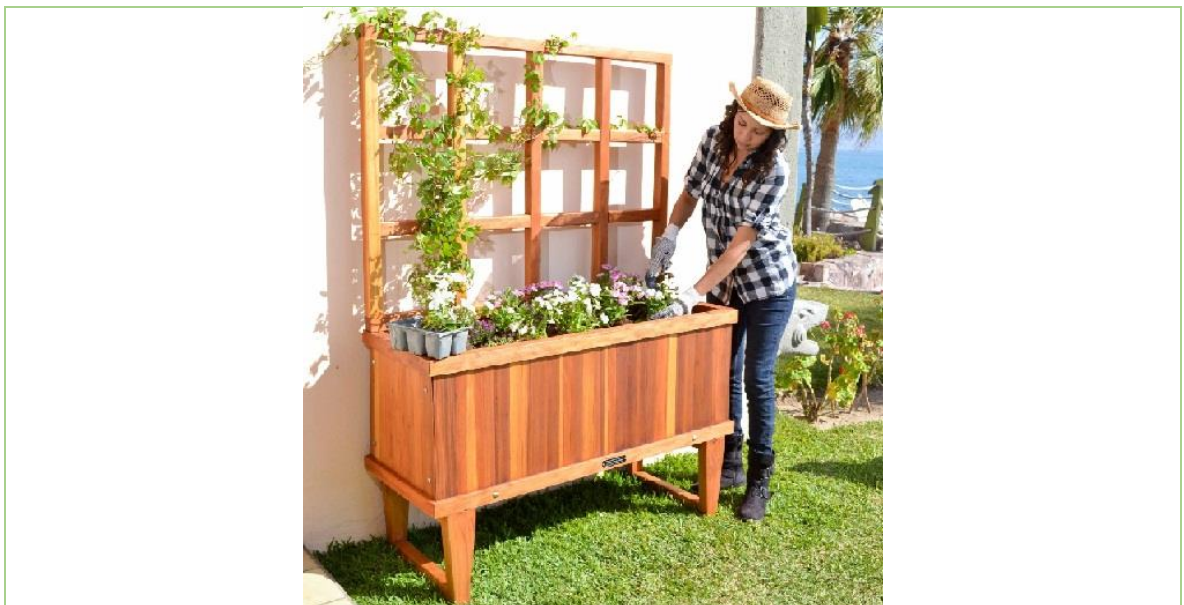
Napa Planter in Redwood 48" L x 18" W x 18" L with 12" H Stand and 36" H Trellis.

Below is a typical stable set up that is not attached to a wall (Box & Stand are 30" H combined and box is 18" W):