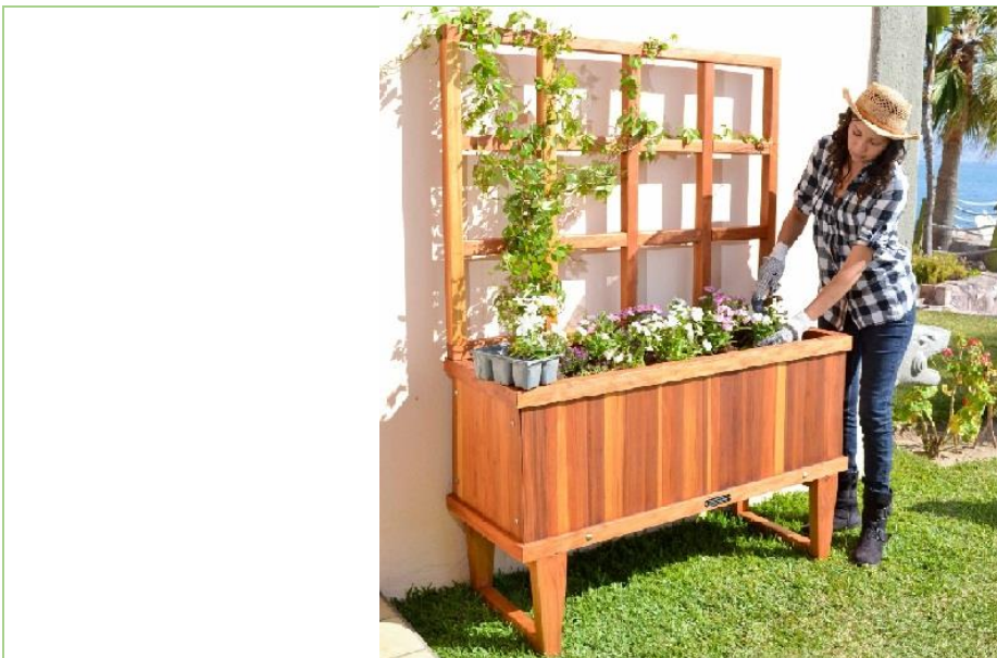
Napa Planter in Redwood 48" L x 18" W x 18" H with 12" H Stand and 36" H Trellis.

Below is a typical stable set up that is not attached to a wall (Box & Stand are 30" H combined and box is 18" W):