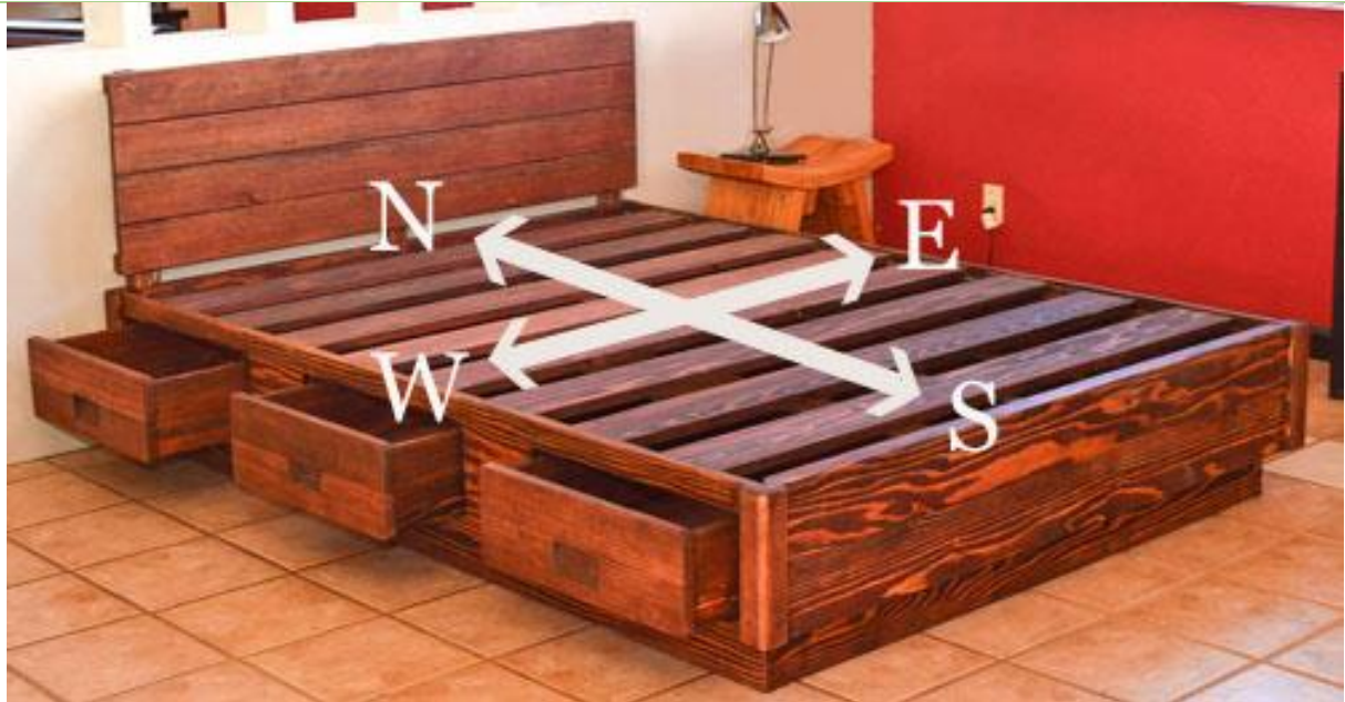
Chest Bed with Drawers on West Side

How do I know which side is North, South, East and West? Yes, it is arbitrary, but we had to do it to figure out where you wanted things. See labeled photo below to determine what we are calling North, South, East and West. Please keep in mind we will prepare a drawing of your order prior to building it, so no worries if you don't get the direction correct initially. You can fix it later when you get the drawing for your feedback. Thank you.