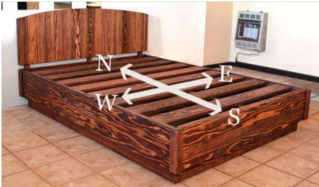
Chest Bed without Drawers