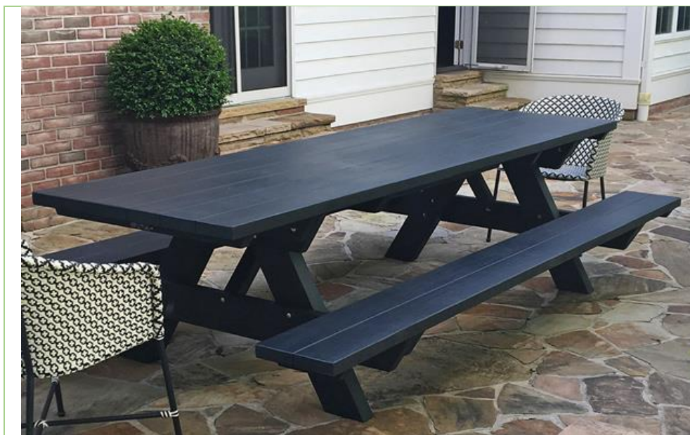
Benjamin Moore: Black Stain, 2131-10

First select the type of paint you want: Benjaminmoore.com