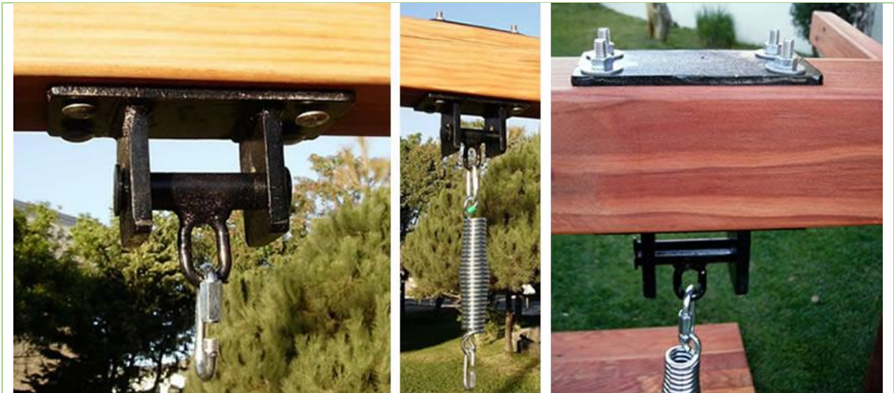
Chain Hanging Hardware

We ship springs with each swing set. The springs allow the seat to give just a bit and is a favorite of many customers. The springs are easily added and removed depending on whether you like the softness it adds to the ride.