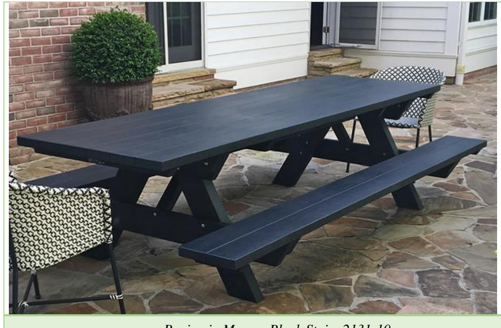
Benjamin Moore: Black Stain, 2131-10

First select the type of paint you want: Benjaminmoore.com