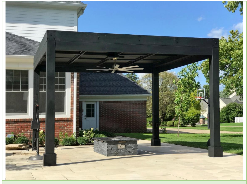
Modern Louvered Pergola – Black Stain