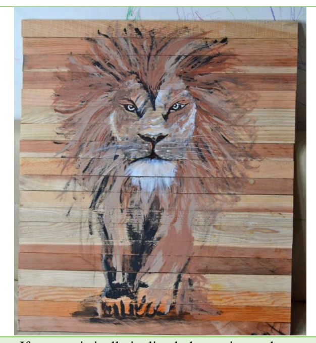
If your artistically inclined, the crating makes a great canvas to: Lion of the Tribe of Juda by Patricia Vallejo

Assembly Service Available Nationwide: All orders over $3,000. in size can choose to have Forever Redwood assemble for you. Just choose White Glove Service in the Shopping Cart or at Checkout. For more information on White Glove, please go to: <u>WHITE GLOVE.</u>