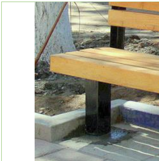
Extra-Long Legs Option (30" long legs to allow you to place in ground with concrete)

The steel frames are powder-coated so they will never rust and are fabricated from 1/4-inch thick steel. For the legs, you have two options: