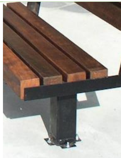
Bolt-Down Legs Option (all hardware included)