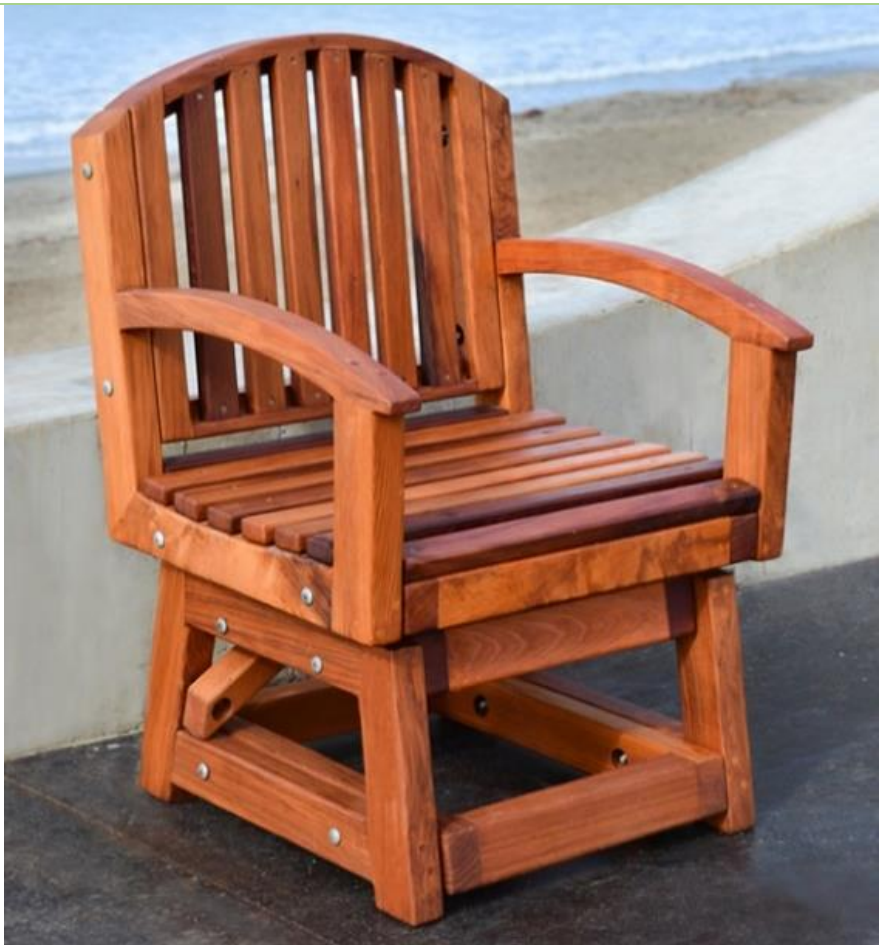
Vera’s Swivel Armchair

Vera's Table set is made to go with Vera's Swivel Armchairs (see photo below). Of course, we won't get upset with you if you just order the table and use your own chairs or benches - just choose the "no seating" option. Thank you!