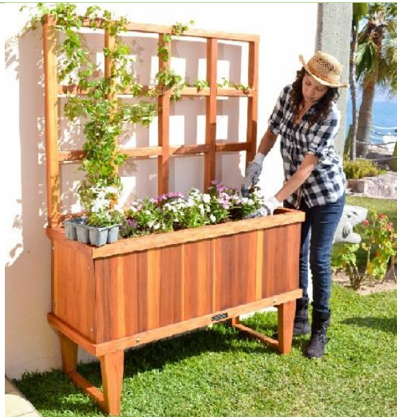
Napa Planter in Redwood 48" L x 18" W x 18" L with 12" H Stand and 36" H Trellis.

Below is a typical stable set up that is not attached to a wall (Box & Stand are 30" H combined and box is 18" W):