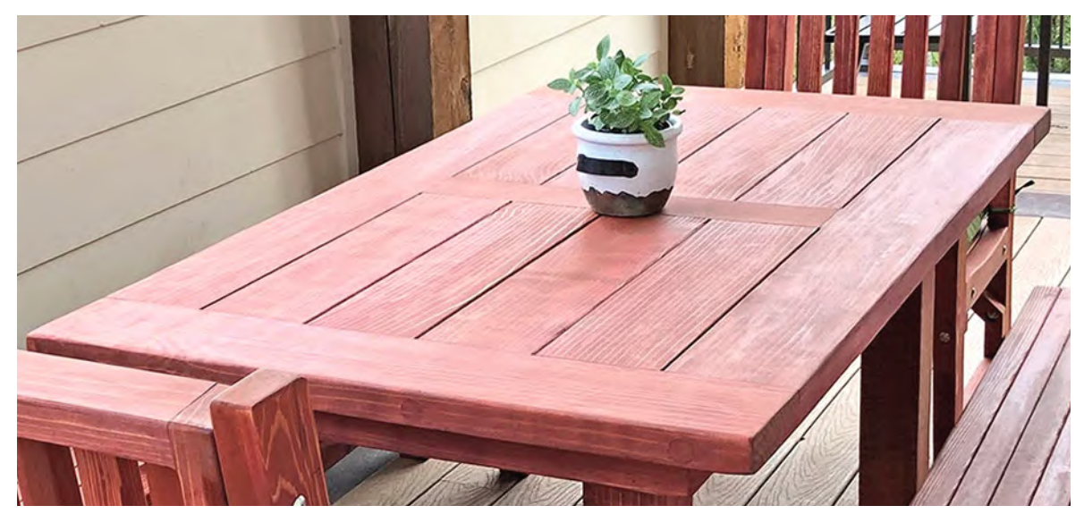
Old Country - Standard Tabletop Design

Both Standard and Seamless Tabletops can be further customized in Old Country Tabletop Style, an old European design that features a perimeter frame with a horizontal dividing board across the center.